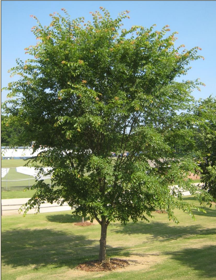
'Frontier' ( Ulmus carpinifolia X U. parvifolia )