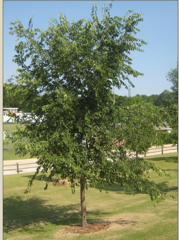
'Homestead' ( U. glabra X U. carpinifolia X U. pumila )