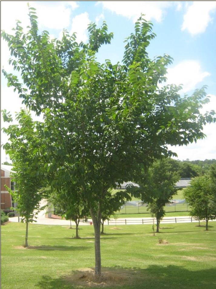
'Pioneer' ( U. glabra X U. carpinifolia )

Date: 5/2014 Survival: 75% Diameter at 1.4m (cm): 3.1 Height (m): 4.5 Crown Shape: Round Insects: Information 11/2014 Disease: None