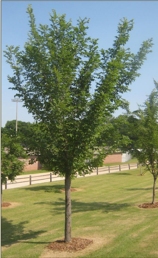
New Horizon ( U. pumila X U. japonica )

Date: 5/2014 Survival: 80% Diameter at 1.4m (cm): 3.5 Height (m): 4.7 Crown Shape: Vase Insects: Information 11/2014 Disease: None