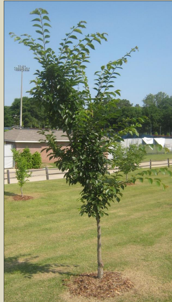
'Prospector' ( U. wilsoniana )

Date: 5/2014 Survival: 70% Diameter at 1.4m (cm): 3.0 Height (m): 3.8 Crown Shape: Oval, Vase Insects: Information 11/2014 Disease: None