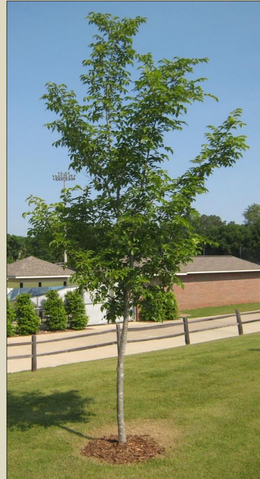
'Patriot' ( U. glabra X U. carpinifolia X U. pumila ) X U. wilsoniana

Date: 5/2014 Survival: 100% Diameter at 1.4m (cm): 2.9 Height (m): 5.8 Crown Shape: Pyramid, Vase Insects: Information 11/2014 Disease: None