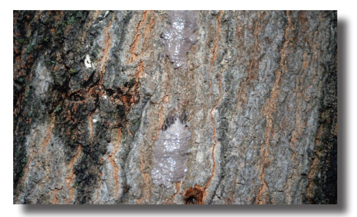
Two egg masses on tree bark.

In addition to seeing the nymphs and/or adults, there are several signs and symptoms that indicate spotted lanternfly is in the area. The most prominent sign is a weeping wound of sap on the trunk of affected trees. Heavy populations can often cause honeydew secretions to build up at the base of the tree, blackening the soil. The largest colonies can also produce large fungal mats at the base of the tree. Increased activity of wasps, hornets, bees, and ants can be seen feeding on honeydew secretions and at tree wounds. Though many other factors can sometimes cause these symptoms they might be early indicators of a spotted lanternfly infestation.