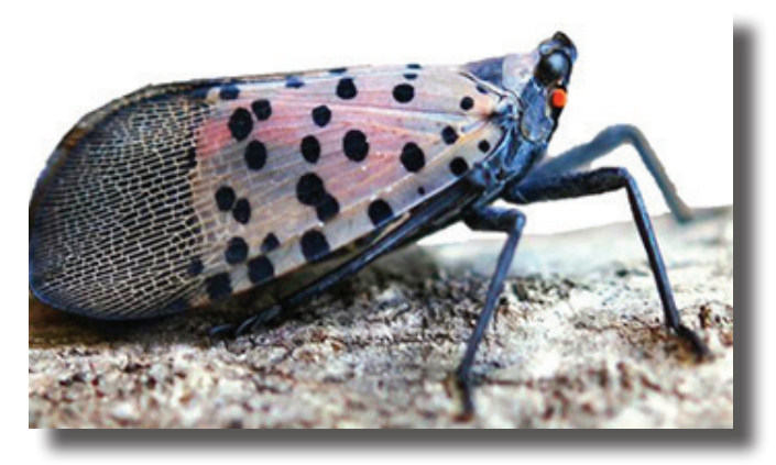
Lycorma delicatula, Adult at rest.

At this time, we do not know of any populations of spotted lanternfly in West Virginia but we are looking for it. If you suspect that you have seen this pest in your area please contact the West Virginia Department of Agriculture, Plant Industries Division at (304) 558-2212.