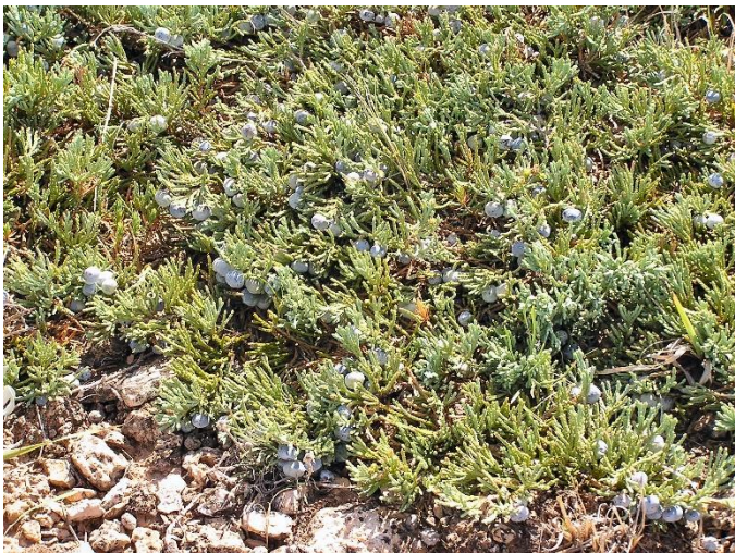
Juniperus horizontalis , Crook County

Juniperus horizontalis , Creeping Juniper, is a creeping evergreen shrub to 6 inches, or rarely 12 inches, tall. The stems can extend for 15 feet or more forming dense mats. The foliage may die back in the center of the plant, especially in warm locations. The leaves are scale-like, yellow-green to blue-green, and aromatic. Male and female cones are borne on separate plants, the female berry-like, blue-purple with a whitish bloom, and to slightly under a half inch across. The plants occur naturally on open dry hills and slopes in the plains, basins, and mountains. They prefer full sun, well drained soil, and tolerate wind, drought, and poor soil. They may require extra water until well established. They are grown for a ground cover, especially for erosion control on slopes. There are many cultivars of different shades of green but many of these were derived from far outside Wyoming. They can be grown from stem cuttings.