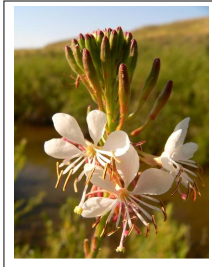
Left: Colorado butterfly plant. By Julie Reeves. From: Reeves, J. 2017. Species Biological Report cover for Colorado butterfly plant, Unpublished. See link below.

Colorado butterfly plant is a showy, semelparous herbaceous plant that grows in mid-seral riparian and wet-meadow habitats in southeastern Wyoming, as well as along the Front Range of the Rockies in Colorado and extreme southwestern Nebraska. It occurs primarily in habitats created and maintained by streams active in their floodplains and requires some disturbance to maintain its habitat. The Colorado butterfly plant was listed as threatened based on the stressors affecting the species (e.g. indiscriminate spraying of broadleaf herbicides and the disturbance of riparian areas that contain native grasses due to agricultural conversion, water diversions, channelization, and urban development (65 FR 62302; October 18, 2000)). Since the listing, the U.S. Fish and Wildlife Service (Service) has entered into voluntary agreements with landowners with this species on their property in 2004 to allow for annual monitoring and has worked with local and federal government agencies to manage and conserve populations on lands they administer. In 2005, the Service designated certain areas in Wyoming as critical habitat 1 for the species (70 FR 1939; January 11, 2005). In 2010, the Service published a recovery