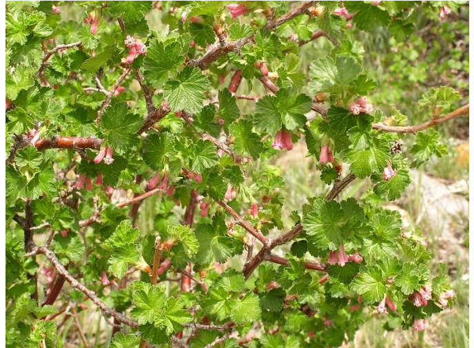
Ribes cereum , Albany County

plants occur naturally on dryish or moist, open, often rocky slopes in the basins, valleys, and mountains. They prefer moist to dry, open or partly shaded, well drained sites and are drought tolerant. Plants are available in the nursery trade. Young plants can be transplanted. Seed needs cold stratification for 120 to 150 days. They can also be grown from semiripe or hardwood cuttings. The plants could be an alternate host for white pine bluster rust. If you have any 5 needle pines, you may not want to grow this plant or any other Ribes species.