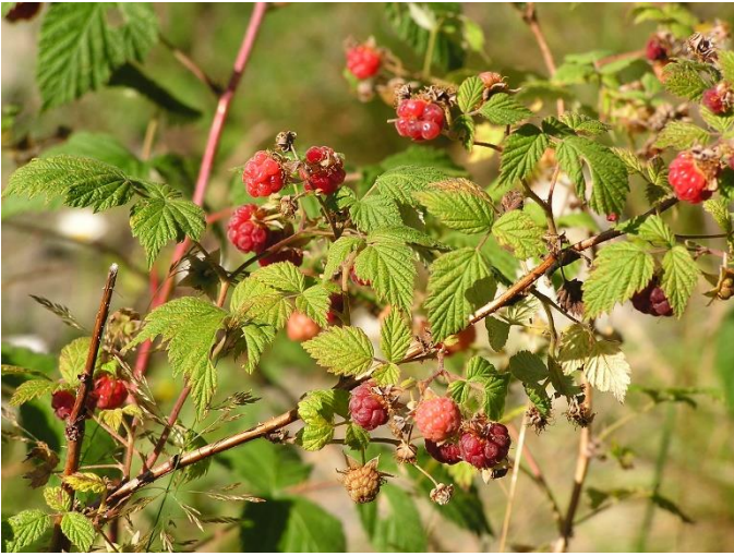
Rubus idaeus , Lincoln County, Montana

Rubus parviflorus , Thimbleberry, is a deciduous shrub without prickles and grows to 3 feet tall. The leaves are simple, to 9 inches long and wide, and lobed and toothed. The flowers are mostly white and to 1.5 inches across appearing from May to July depending on elevation. The fruit resembles a typical red raspberry but is not as palatable. The plants occur naturally in shaded or part shaded areas in the mountains. They prefer moist but well drained soil and at least partial shade. Propagation is similar to Rubus idaeus above.