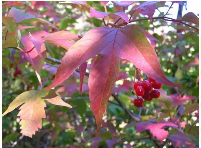
Viburnum opulus , Crook County

small clusters at the branch tips, and appear from May to July. The fruits are berry-like with a single seed, red or reddish-orange, to a half inch across, acidic, and attractive to birds. Fruit set may be better if several plants from different sources are planted together. The plants occur naturally in moist woods and thickets in the Black Hills. They prefer moist, at least partly shaded areas in loamy soil. Several cultivars are available but some are the European variety even if labeled americanum . They can be grown from seed which needs 60 to 90 days warm stratification followed by 30 to 60 days cold stratification. Barely cover with soil to allow some light exposure. They can also be grown from hardwood cuttings.