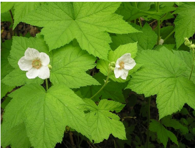
Rubus parviflorus , Crook County

Rubus parviflorus , Thimbleberry, is a deciduous shrub without prickles and grows to 3 feet tall. The leaves are simple, to 9 inches long and wide, and lobed and toothed. The flowers are mostly white and to 1.5 inches across appearing from May to July depending on elevation. The fruit resembles a typical red raspberry but is not as palatable. The plants occur naturally in shaded or part shaded areas in the mountains. They prefer moist but well drained soil and at least partial shade. Propagation is similar to Rubus idaeus above.