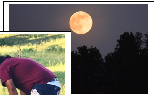
Devils Tower Natl Monument (left) and Bear Lodge Mountains (mid and right) were two Black Hills destinations of the 2017 WYNPS Annual Meeting