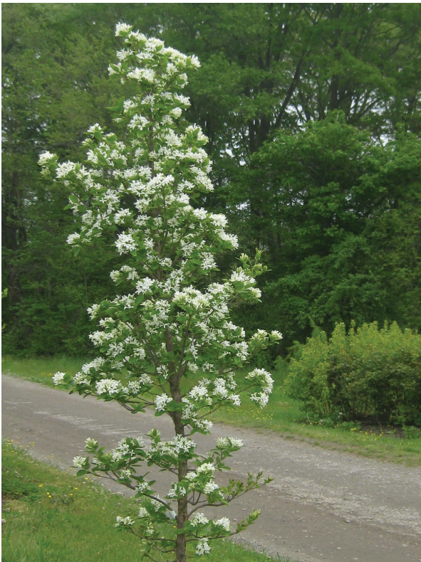
CHIONANTHUS RETUSUS 'TOKYO TOWER'

“Because of your regret and pity for My suffering, never again shall the dogwood tree grow large enough to be used as a cross. Henceforth it shall be slender and bent and twisted and its blossoms shall be in the form of a cross . . . two long and two short petals. And in the center of the outer edge of each petal there will be nail prints, brown with rust and stained with red, and in the center of the flower will be a crown of thorns, and all who see it will remember . . . that it was upon a dogwood tree I was crucified and this tree shall not be mutilated or destroyed, but cherished as a reminder of My death upon the cross.”