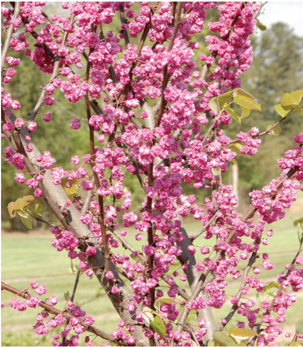
CERCIS CANADENSIS 'PINK POM POMS' PPAF