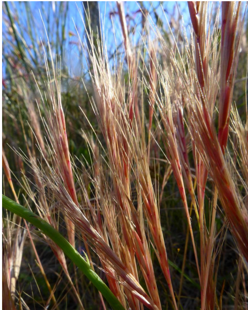
Vulpia ciliata subsp. ambigua at Berrow Dunes (2014).

A loosely tufted annual of disturbed sandy places, found on coastal sand dunes in Somerset but elsewhere also inland on sandy heaths and roadsides. In VC5 first discovered on fixed dunes at Minehead Warren, Dunster (SS9946) by C.J. Giddens and M. Tulloh in 1972 ( Watsonia 17 : 484). It was recorded further west at Minehead Warren in 1992, and in 1999. In 1989 this species was recorded outside the chalets at Dunster Beach and was refound there in 2019. This small stretch of coast remains the only known location in VC5. Vulpia ciliata subsp. ambigua was unknown in Somerset until 1960, when it was found by Cecil Sandwith and Noel Sandwith to be abundant over a small area of fixed dune at Berrow (Sandwith & Sandwith, 1961): in VC6 it is still only known from Berrow Dunes. This grass is distributed around the coast of England and Wales and inland in suitable sandy habitats, from south of the Humber to the west coast of Wales. Sites in Somerset are within this range.