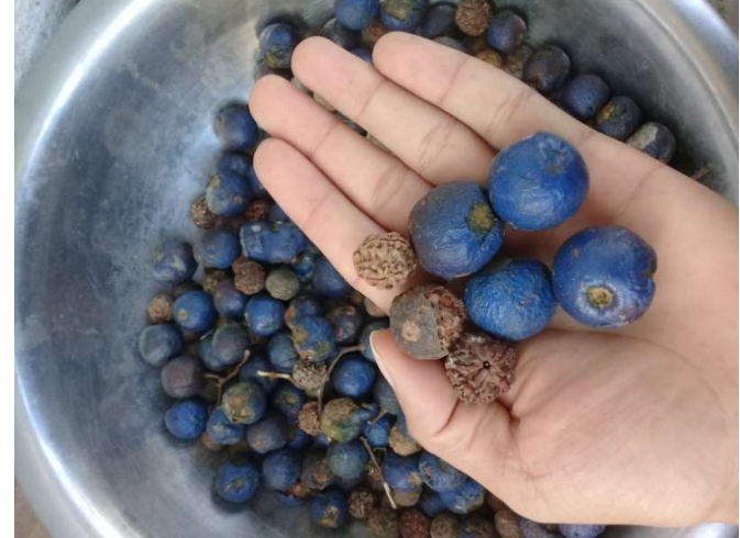
Figure 2. Seeds of E. sphaericus

boiling the seed in hot water. Besides this, the seed could be treated with 1% H2SO4 solution, which eventually softens the hard outer layer (Kumari et al, 2018). Pant et al. (2013) on the other hand says the collected seeds are washed with concentrated sulphuric acid for 15 min at first then cleaned with tap water and dripped in water at 40°C for about 48 hours. Once the seed is ready, it is sown at the depth of 1-1.5cm in well drained, slightly acidic (6-6.3) pH to neutral (6.3-7.3) pH soil (Pant et al., 2013). Around after 40 days to 8 months, seed develops into seedlings and it could be transplanted in cultivable land commercially (Kumari et al., 2018; Pant et al., 2013).