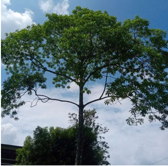
Figure 3. Tree of E. sphaericus

the Rudraksha rosary, acupressures the fingertip which is very useful in the blood circulation of brain and eyes, similarly, hot nature of Rudraksha melts the cholesterol which helps in the easy circulation of blood and also Rudraksha oil obtained by boiling 10 Rudrakshya with 9 pieces of garlic in 200ml of ginger oil, when applied on chest helps to cure pneumonia (Rao and Swamy,1997).