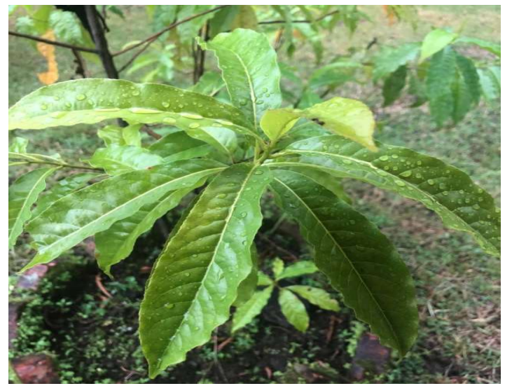
Figure 1. Leave of E. sphaericus

ASIAN JOURNAL OF PHARMACOGNOSY Asian Journal of Pharmacognosy 6(3): 15-21 eISSN-0128-1119