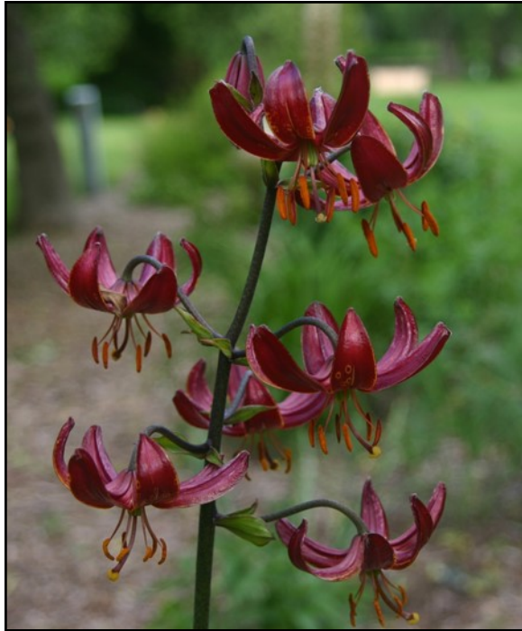
Lilium martagon 'Claude Shride'