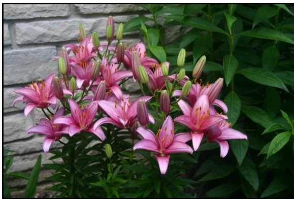
Lilium 'Mount Duckling', an Asiatic Hybrid