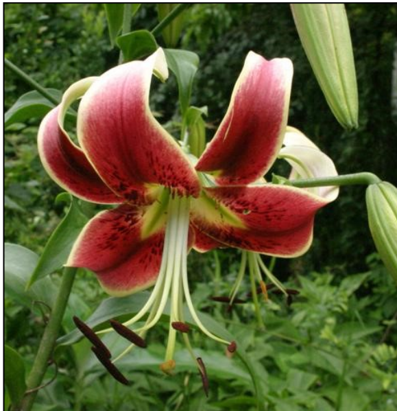
Lilium 'Scheherazade', an "Orienpet"