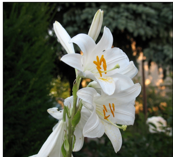
Lilium candidum , the Madonna Lily