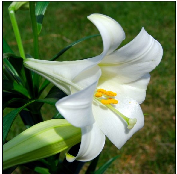
Lilium longiflorum , the Easter Lily