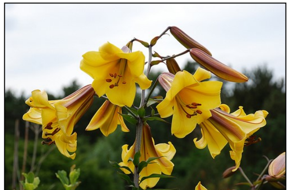
Lilium 'Golden Splendour'