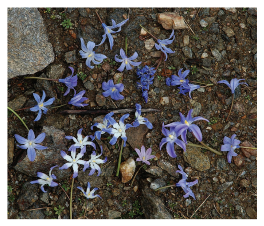
Fig. 4. Flowers of Chionodoxa and Scilla bifolia (with numerous small flowers) on Bozdağ. Chionodoxa tmolusi is at lower left and centre, with tepals half white, half blue; the rest are C. luciliae , showing variation in size and colour.

Whittall's collectors travelled far into the interior of Anatolia, almost certainly as far as to the Tauros above Antalya and as far as Konya (Stapf, 1924). In a letter to Kew in 1897 he says: