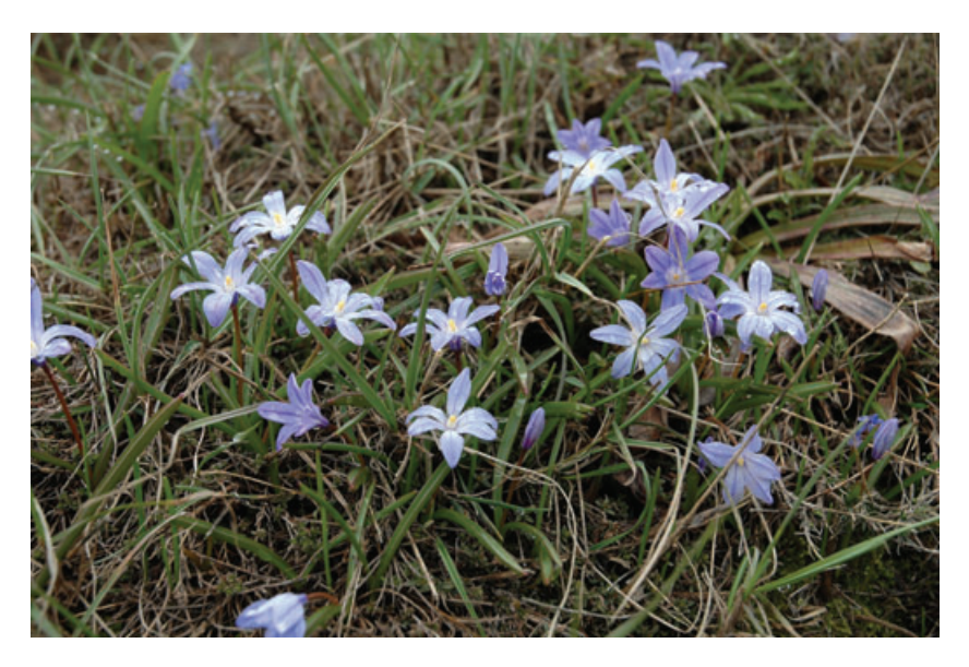
Fig. 3. Chionodoxa luciliae Boiss. Typical form growing on Bozdağ.