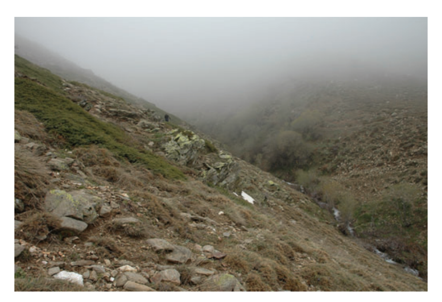
Fig. 5. Habitat of Chionodoxa on Bozdağ: C. luciliae on the rocky slope left and centre, C. tmolusi along the stream on the right.

The photograph of a collection of flowers from one small area (Fig. 4) shows how difficult it is to define and name these bulbs, when such a variety of flower shapes and sizes can be found on one small mountainside.