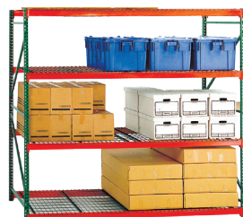
BULK STORAGE RACKS Record Archive Racks Tire Racks -