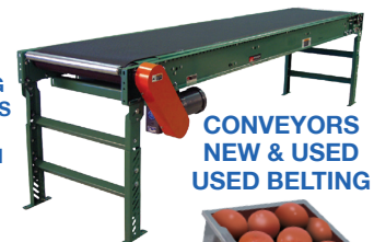
CONVEYORS NEW & USED USED BELTING