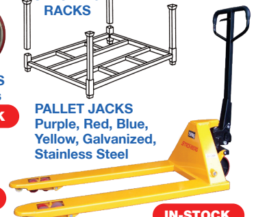
PALLET JACKS Purple, Red, Blue, Yellow, Galvanized, Stainless Steel