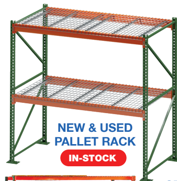
NEW & USED PALLET RACK

"It gets a nice fade into a great classic fall spectrum," Dinsdale said. It's visually striking and versatile, accepting a hard pruning for a formal edge or a more arcing form with textured shoots, That same arching habit appears on B. thunbergii 'Royal Cloak' (3-5 feet high by 3-5 feet wide; Zones 4-8), one of Hall's favorites and a top seller at Youngblood. It's fast-growing with large reddish-purple leaves that emerge red in spring.