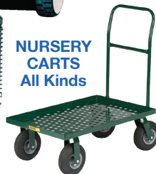
NURSERY CARTS All Kinds