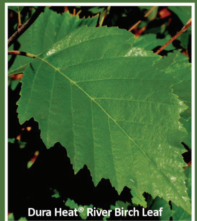
Dura Heat® River Birch Leaf