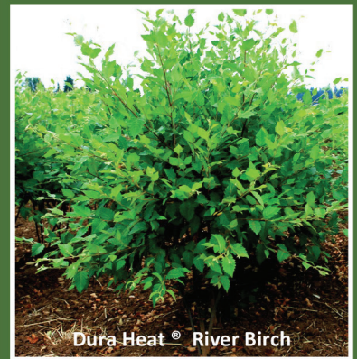
Dura Heat® River Birch

QUALITY FLOWERING & SHADE TREES SINCE 1925