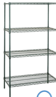
WIRE SHELVING FOR NURSERIES • Chrome • Stainless Steel • Gray Epoxy • Green Epoxy • Black Epoxy Chrome, Gray, Green