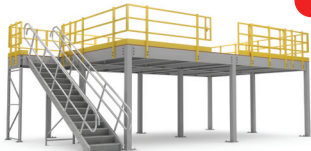
MEZZANINES - All Types & Sizes MFG. in Donald, Oregon