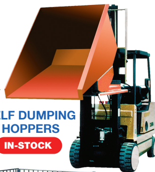
SELF DUMPING HOPPERS