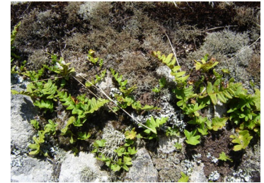
Polypody fern and lichens

Peltigira canina - Dog lichen Parmelia saxatilis - Crottle Cladonia pyxidata - Cup lichen Lecanora atra - Black Shields Ochrolechia parella - Crab's-eye lichen Homalothecium sericeum - Silky Wall Feather-moss Dicranum scoparium - Broom's Fork-moss Hypnum cupressiforme - Cypress-leaved Plait-moss Campylopus introflexus - Heath Star Moss Polytrichum formosum - Bank Haircap Grimmia tricophylla - Hair-pointed Grimmia Polypodium vulgare - Common Polypody Sedum anglicum - English stonecrop