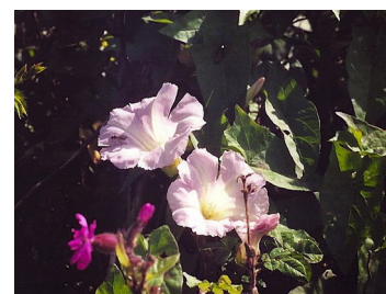
Pink hedge bindweed