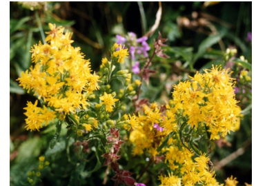
Wild golden rod