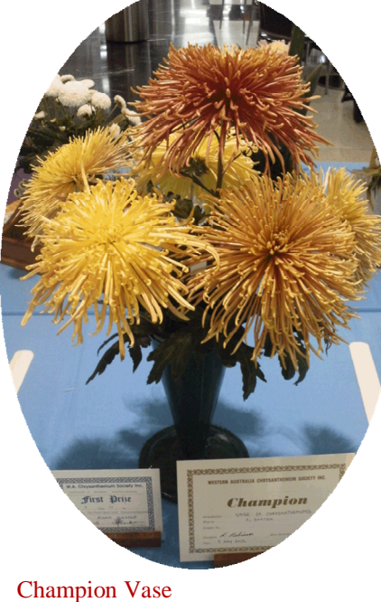
A lovely vase of 5 Stoakes Serena Grower: Ron Atyeo