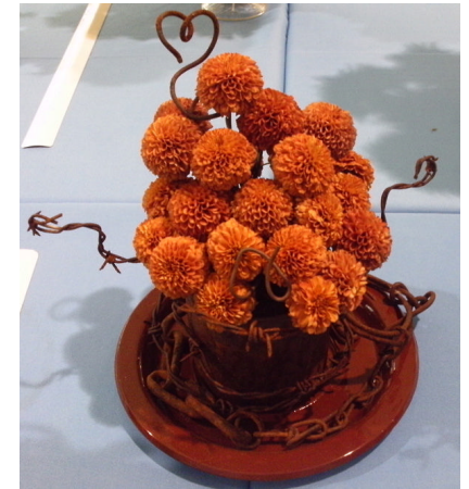
Rust & Corrosion Roma Baxter