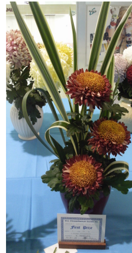
Three Flower Arrangement Val Heading