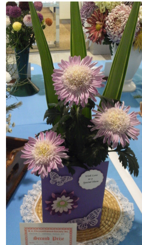
Mother's Day Arrangement Olive Clayton