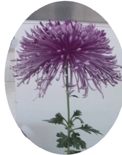
10 Fantasy Grower: Roy Shilling Seatons Galaxy