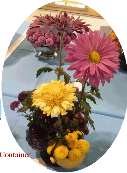
Arrangement in an Unusual Container Leila Blackwell