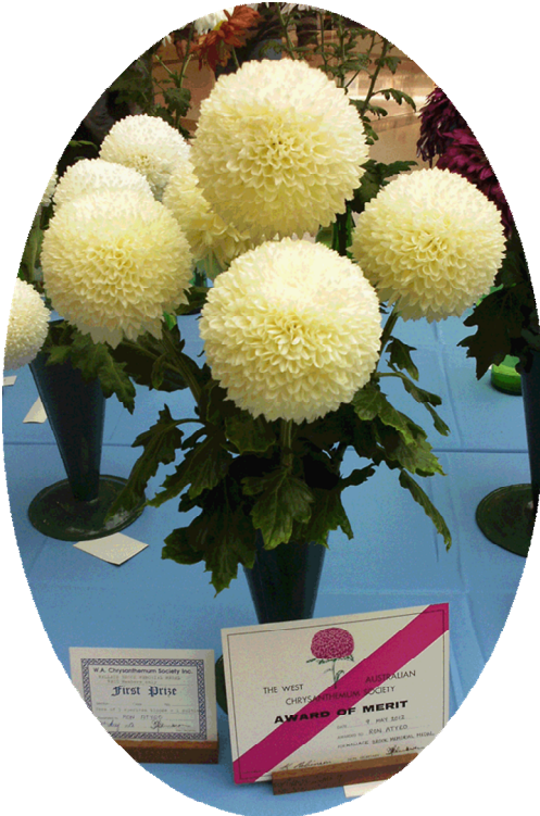
A lovely vase of 5 Stokes Serena Grower: Ron Atyeo