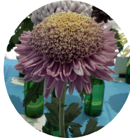
6 Anemone Centred Grower: Ralph Foster Edith Mechen