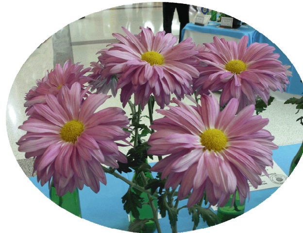
7 Single (cut) Grower: Roy Shilling Charmaine