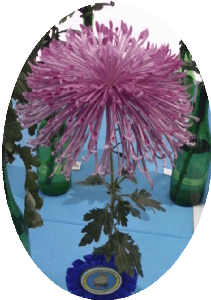
Seaton's Galaxy Grower: Roy Shilling