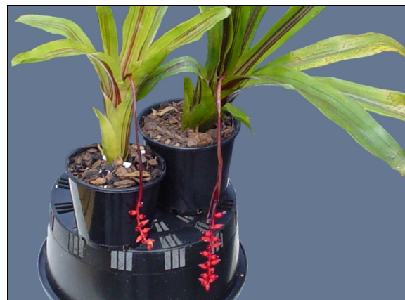
Aech Red Ribbon

We perceive white or yellow variegation as a desirable trait which adds to the visual beauty of a plant such as Neoregelia imperfection . The reduction of chlorophyll (which forms the green part of the leaf) reduces the plants vigour and makes it grow slower and might result in the plants requiring more exacting growing conditions and