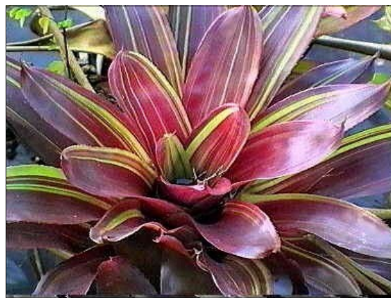
Neoregelia 'Amazing Grace'