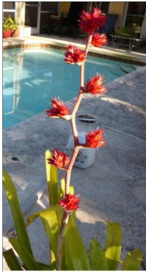
Hohenbergia stellata – photo courtesy of Florida West Coast Bromeliad Society