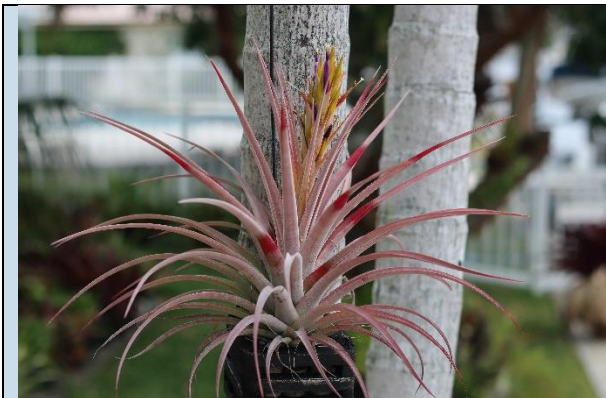
Tillandsia 'Captain Jack'