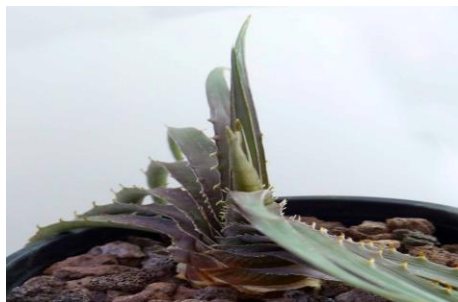
D. estevesii