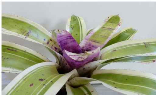
N. 'Inkwell'

Sorry about having to get out the dictionary to find out the meaning of certain words but you should get the gist of what is said. Offsetting can give different looking plants especially in the type of variegation. If they are unusual they should be selected and destroyed if you want to preserve the correct name. This selection rarely happens. Thus the plant that was called Neoregelia 'Alba' with no variegation in sight could well have been an offset from a albomarginate plant without variegation and should have had 'Novar' (No variegation) added to mother's name. The marking on the leaves suggest N. concentrica in its parentage somewhere. As for the colour of the centre leaves you have to be careful because this is variable if we heed what was said by botanists in years past for plants now treated in synonymy. Then there was a N. concentrica Alba on the label where the centre leaves had gone almost completely white with very little green. An attractive plant but as growers we think of the future and therefore offsets. Selection of what offsets to grow is a decision of the grower. Here we had one offset that was almost totally white (I call this an albino) which had no green parts to sustain it when removed from Mother. A decision has to be made on whether to watch this offset slowly die or concentrate on the other offset that had a much greater chance of survival.