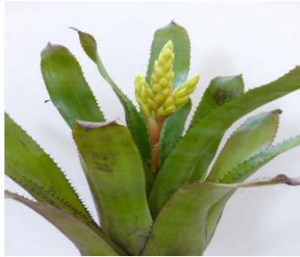
xQuesmea 'Jigsaw Puzzle'