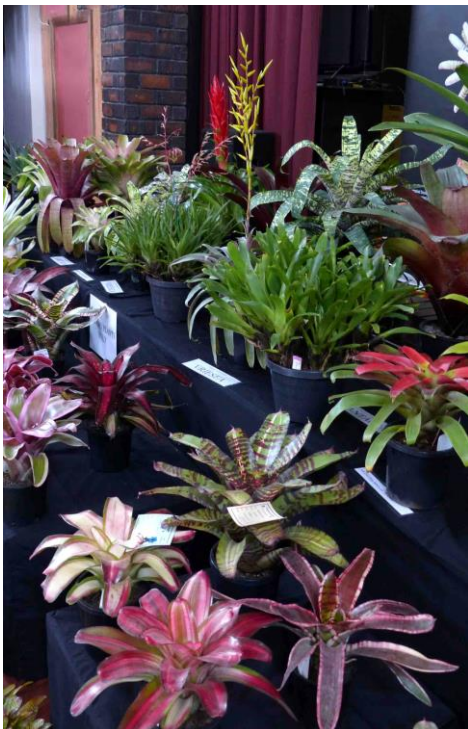
Section of display

This was another successful event, attendances both days & sales were down a little from the previous event.