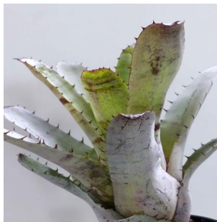
xHohenmea 'Ninja Ghost'