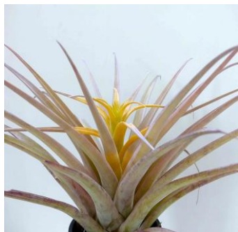
Tillandsia capitata