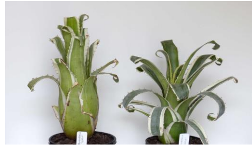
'Hohenbergia 'Karla'

Much was discussed as to why the 2 plants of Julie's 'Hohenbergia 'Karla' were growing differently and yet no two plants grow exactly the same even when given the same growing conditions. The following makes interesting reading:-