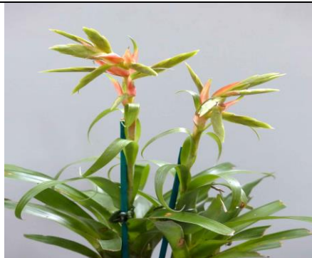
T. confertiflora

And then to the potted stuff where we saw T. chiapensis in full flower. Reports from around Australia seem to suggest that 2018 is the year of the chiapensis. While the original descriptin says it has a single spike it seems that with feeding you can get multiple spikes. The one that caught great attention was T. confertiflora which comes from the Ecuador/Peru border area. It has been discussed at past meetings as the photo below shows.