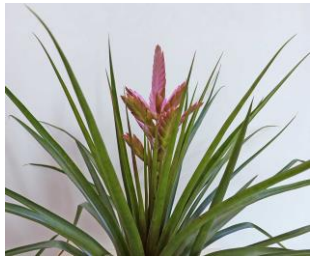
xWallfussia 'Creation'

Cryptanthus bahianus is one of species that grows well in Adelaide and is one that has not changed its name. Yes, there have been name changes here that will not affect Adelaide growers. I have dared to suggest to the Cryptanthus Society that they change their name to Cryptanthoid Society!