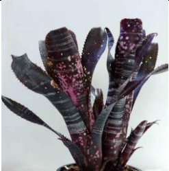
B. Obi-Wan