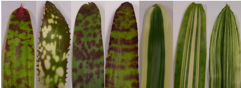
marmorate blotch spot zonate albo variegate striate