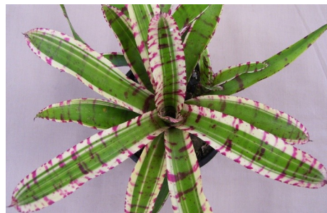
Neoregelia 'Groucho' showing marginated variegation and zonation