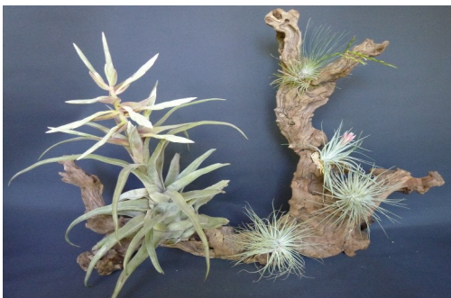
Tillandsia's on driftwood