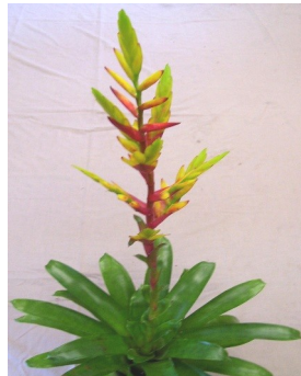
Vriesea 'Pyjamas' (unreg)