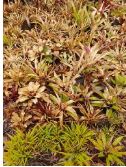
Aechmeas seemed harder than Neos!