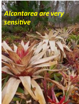
Alcantarea are very sensitive