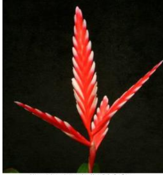
Vriesea dubia

No details of the petal structure are known. Thought to be closest to Vriesea dubia