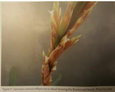
Figure 9. Cipurosis asmussii inflorescence detail showing the flowers and bracts.

There will be more to come as the taxonomists re-evaluate current species as well as new species and will possibly include Vriesea dubia .