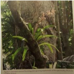
Figure 7. Cipurosis asmussii flowering plant growing terrestrially on the tree trunk.