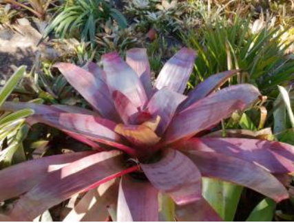
Alc. Silver plum . . . it might be ok! (left)

My sister-in law and I set off on our annual trip to the Nambour Garden Festival as usual at the beginning of July. The frost cloth was in places as were the plastic 'walls' for the shade houses. Plants moved away from exposure to frost, so that our dutiful husbands would not have to tippy-toe out in the cold to cover any plants if frost was threatening. We didn't count on a -4.5^{\circ}\text{C} and a couple of mornings nearly as cold. No frost cloth or covering made much difference. It went where no frost has gone before! The pictures tell the story.