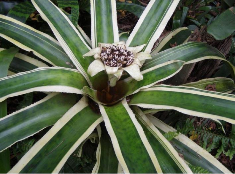
Edmundoa 'Alvim Seidel'

Upcoming Speakers: September: Shade Plants / Begonias - Ross Bolwell