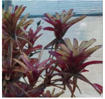
Even 'inside' didn't escape!