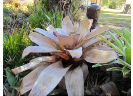
2 weeks later - No such luck (right)