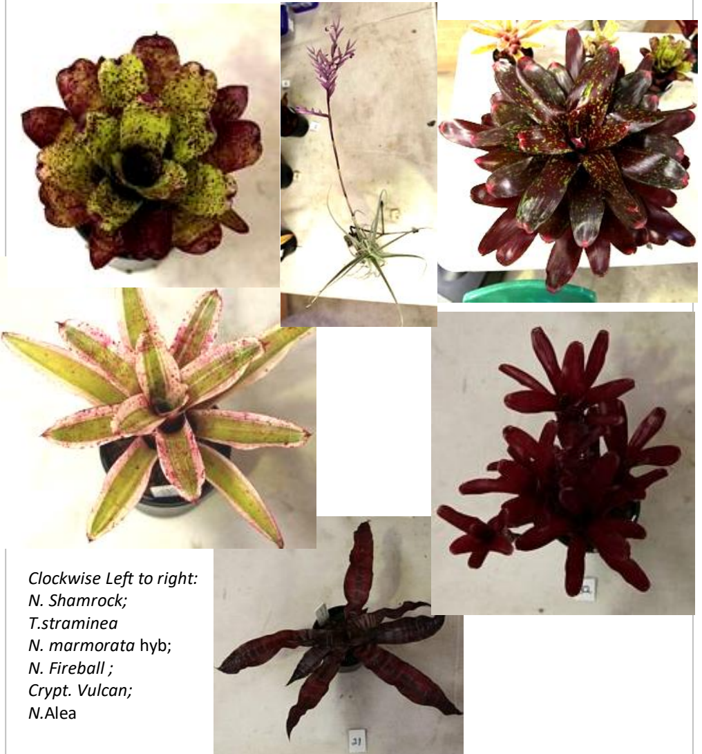
Clockwise Left to right: N. Shamrock ; T.straminea N. marmorata hyb; N. Fireball ; Crypt. Vulcan ; N.Alea