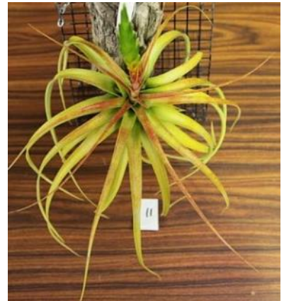
Clockwise left to right: Till. leonamiana ; Neo. Prinsler ; Till. Roland-grossolinii ; 'Under the Tree', 'Nudie'