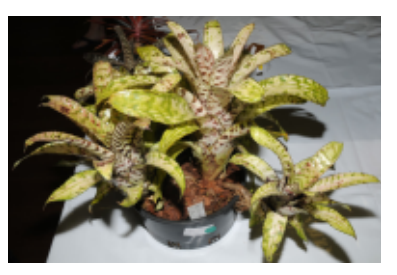
Aechmea orlandiana cv. 'Snowflakes'