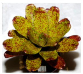
Neoregelia 'Morning Rain'