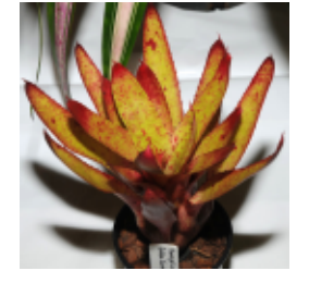
Neoregelia 'Golden Jewel'