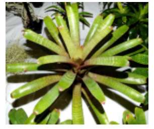
Vriesea 'Red Chestnut' x fenestralis