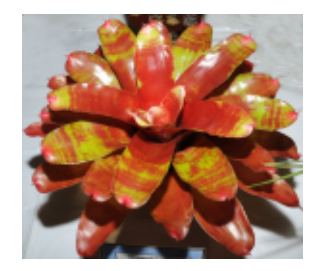
Neoregelia 'Lambert's Pride' Reserve Champion