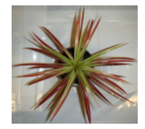
xNeophytum 'Galactic Warrior'