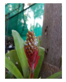
Kerry's Aechmea 'Blue Nude' or A. 'Wardell'