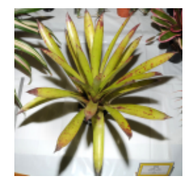
xNeomea 'Light Years'