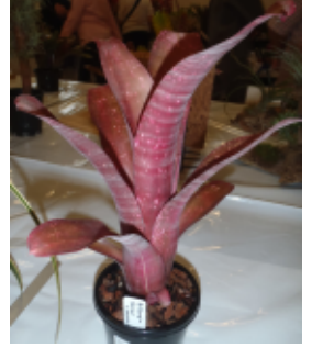
Billbergia 'Bob Earl' x amoena var. varidis