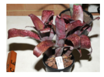
Billbergia 'Clyde Wasley'