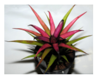
Aechmea recurvata var. benrathii