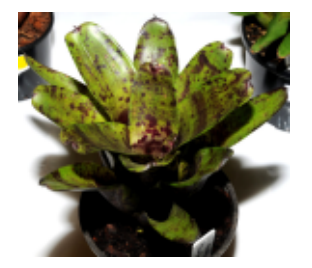
Neoregelia 'Blueberry Muffin'