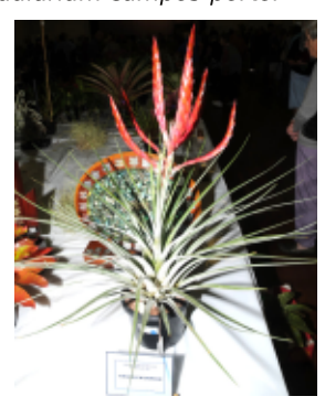
Tillandsia fasciculate 'Percal' Grand Champion