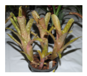
Billbergia amoena x 'Catherine Wilson'