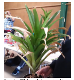
Ron's Tillandsia rubella