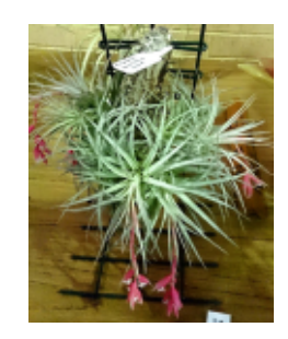
Tillandsia recurvifolia hybrid