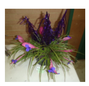
"Tribute to Prince"