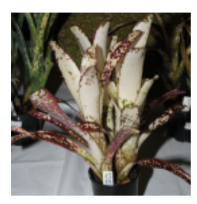
Billbergia 'Moon Tiger'