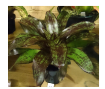
Neoregelia 'White Hot Embers' Neoregelia 'Lime & Lava'