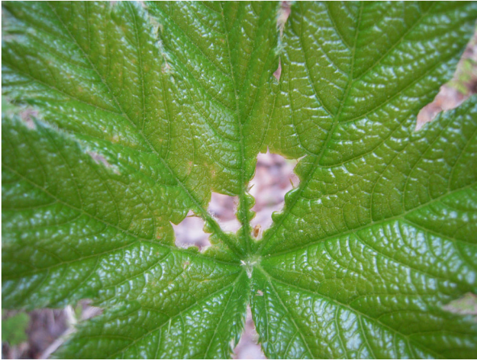
Figure 1: Damage to leaf of devil's club, May 19, 2014.