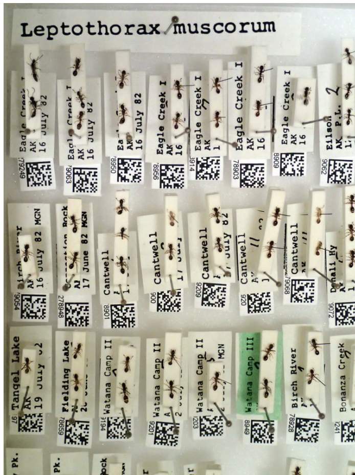
Figure 1: Multi-mounted ants from the Mogens Nielsen Alaskan ant collection.

Diptera, Hymenoptera, Collembola, Acari, Thysanoptera, Chilopoda, and Mollusca. All records would share the same container of the single jar with a barcode. This would make it much easier to pull together all the bulk samples that contain taxa of interest which might otherwise be missed if the jar was a single record identified only as 'Animalia.'