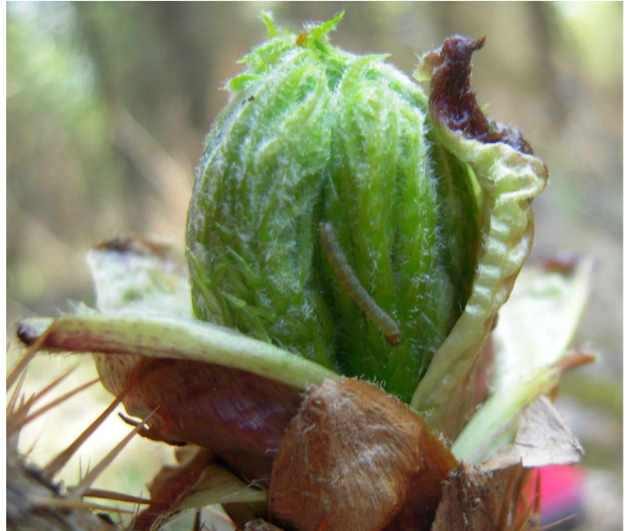
Figure 3: Caterpillar on bud of devil's club, May 14, 2014.