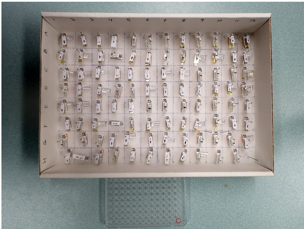
Figure 1: Specimens in grid and empty microplate.

4. Sequencing. The completed plates were mailed to the CCDB where the samples were processed and sequenced. Eventually, the sequence information was uploaded to BOLD by personnel at CCDB where it can be analyzed.