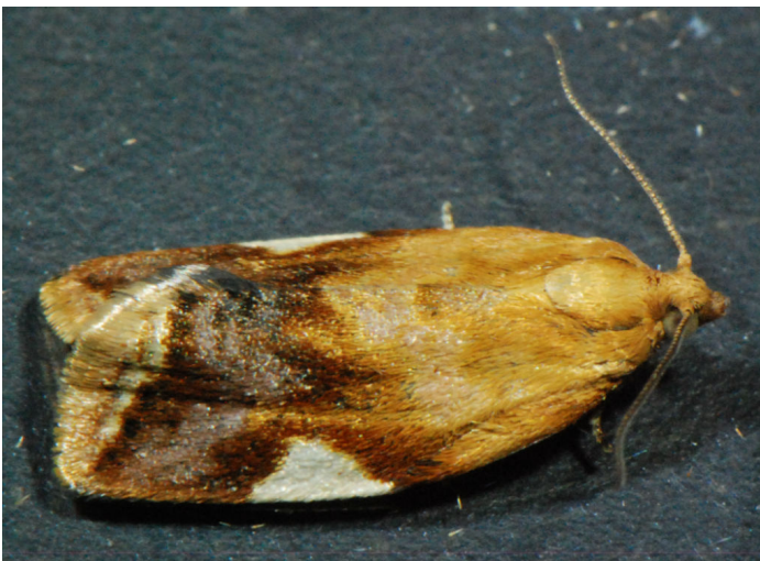
Figure 6: Adult C. persicana (KNWR:Ento:10489), May 28, 2014.

After two weeks, the caterpillars had eclosed. Jim Kruse identified them as Clepsia persicana (Fitch, 1856) (Tortricidae), the White Triangle Tortrix, based on a photograph (Figure 6).