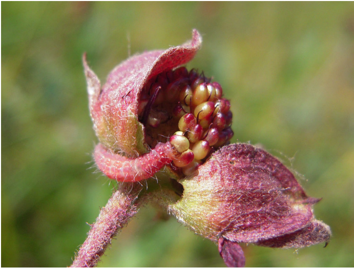
Figure 8: A. pica larva consuming a seed of C. palustre .

±15m. 17 Jul 2014. Matt Bowser. On fruits of Comarum palustre . (KNWR:Ento:10638, KNWR:Ento:10642, KNWR:Ento:10643).