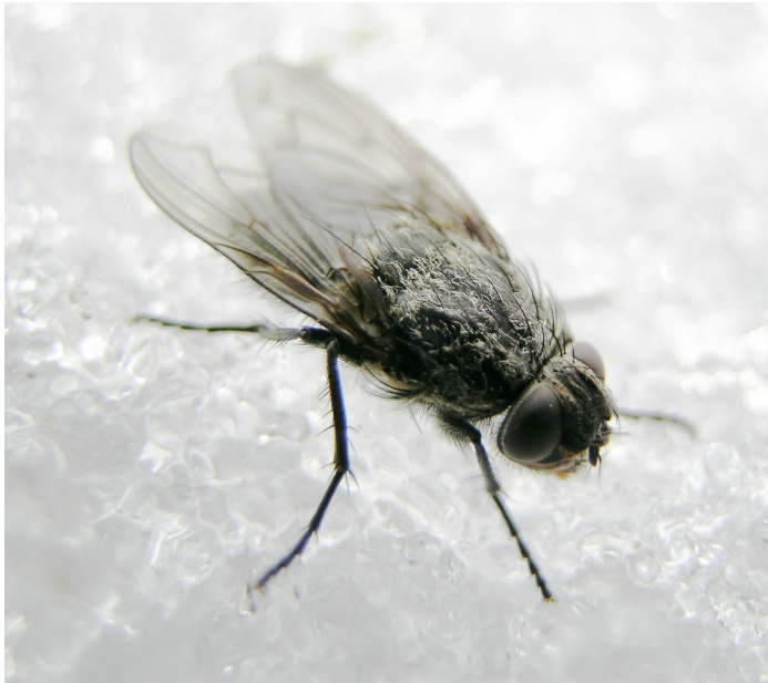
Figure 1: Adult female Pollenia vagabunda , February 17, 2015 (specimen record: KNWR:Ento:10698).

During an extended warm period this February, cluster flies (Calliphoridae: Pollenia , Figure 1) were one of the