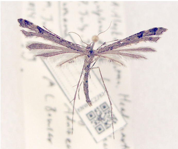
Figure 9: Adult A. pica (KNWR:Ento:10638). Original image: http://arctos.database.museum/media/10441795 .