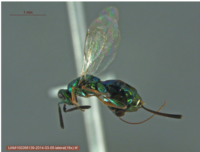
Figure 2: Example of specimen photographed prior to sampling for DNA barcoding. Specimen record: UAM:Ento:145767. Original image: http://arctos.database.museum/media/10436441 .

5. Analysis. The returned sequences were compared to the thousands in BOLD. The BOLD website can calculate percent match to different taxa levels, give a list of previously identified specimens with the closest match, and generate neighbor-joining trees, along with a slew of other functions to help researchers interpret their sequence results. SM made judgment calls on the quality of the BOLD identification matches. There are multiple reasons a match may not be strong or unique. There are still many species that have not been added to the BOLD library (only 156,845 formally described animal species have DNA barcodes, which is just 7.8% of the total ~2 million described animal species) and the number and quality of identified sequences has to be taken into account. It is possible misidentified specimens were submitted to the library or more than one species share the same DNA barcodes (these species might be good biological species, or taxonomic errors that should be synonymized). Sometimes species can be eliminated by comparing known geographical ranges (no identifications of Alaskan specimens were accepted unless that species is already known from Alaska or is known to occur in a region close to Alaska). Some specimens were only possible to identify to family or genus level.