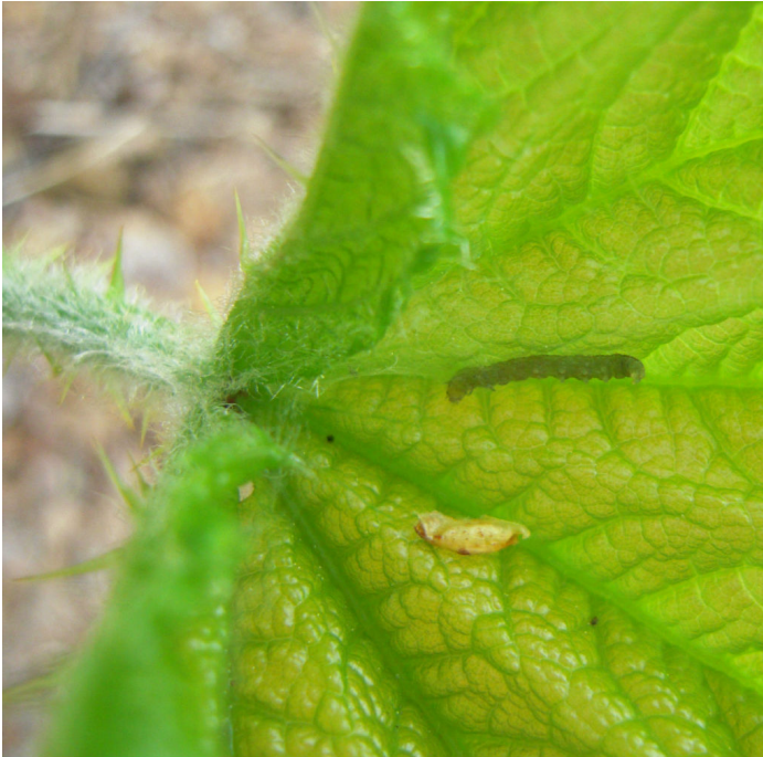
Figure 5: Caterpillar on leaf of devil's club, May 19, 2014.