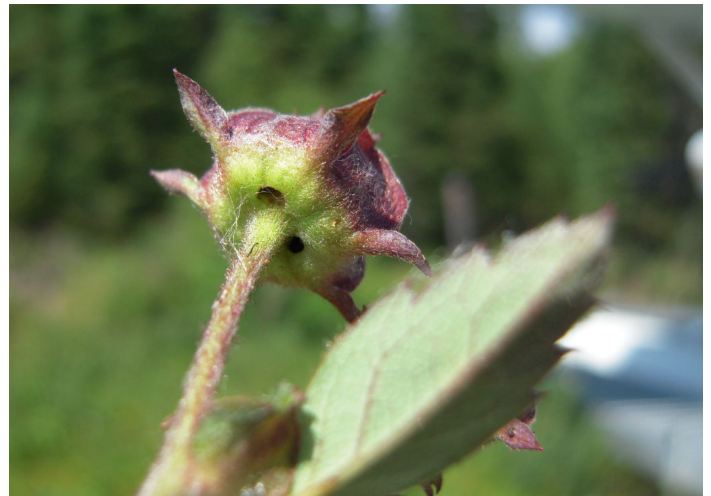
Figure 7: Holes in sepals of C. palustre .

On July 14, around the edge of Headquarters Lake in Soldotna, I observed a number of larvae feeding on inflorescences of Comarum palustre L. The larvae had eaten holes through the bases of the sepals (Figure 7). Some larvae could be found inside of the inflorescence between the sepals and the seeds where they fed on seeds while being concealed by the sepals (Figure 8). Other larvae remained on the stem of the plant, boring holes through the sepals and reaching their heads through the holes to get at the seeds. The caterpillars chewed through the seed coat and ate out the contents.