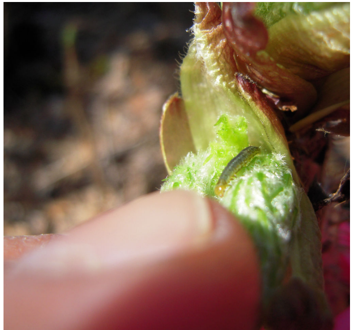
Figure 4: Caterpillar on bud of devil's club, May 14, 2014.