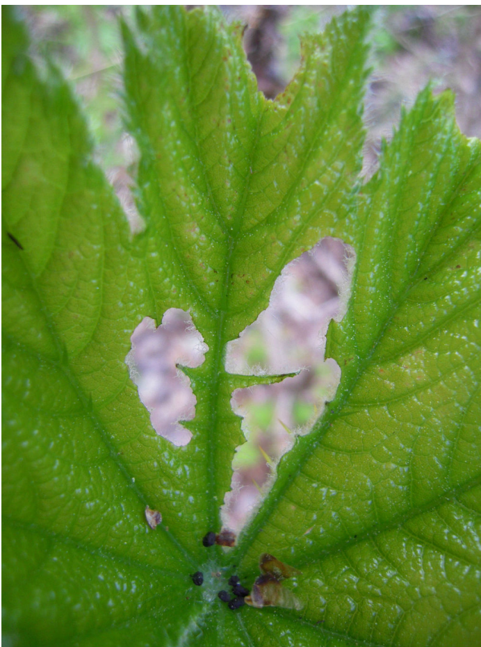
Figure 2: Damage to leaf of devil's club, May 19, 2014.