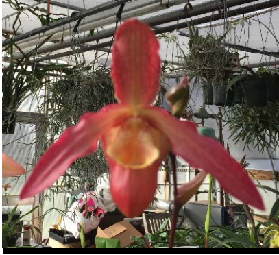
Inca Embers 'Krull-Smith #1' (Andean Fire x longifolium) – From the JOE/KS collection. These can be really special. Very similar to Noirmont (Mem Dick Clements x longifolium) one of our favorites. Tall branching inflorescences and red flowers are expected. 4.5" pots Blooming Size Divisions $65