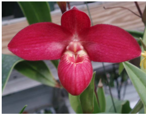
WSO 4686 Bald Eagle Creek x Saint's Apprentice 'Carmin Bouquet' AM/AOS (Pictured) – Beautiful compact growing solid reds. Limited. 2.5" pots 3-4" Is Seedlings $25