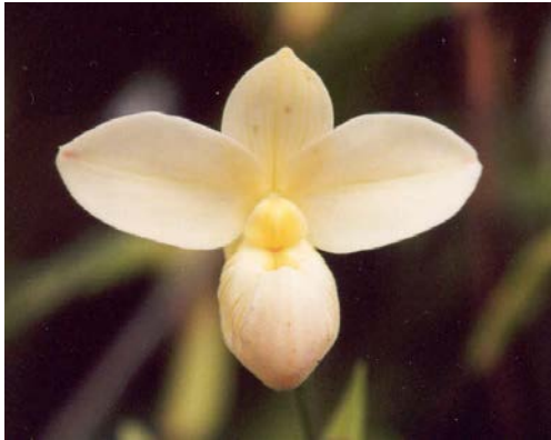
WSO 4810 Saint Ouen flavum (besseae flavum 'Broadwaters' x Hanne Popow flavum 'Sterrettania' HCC/AOS) – Yellow! Limited. 2.5" pots 3-4" Is Seedlings $30; 3.5" pot NBS Seedlings $45