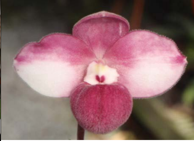
WSO 4794 Memoria Estelle Getty (longifolium x fischeri 'Joan' AM/AOS) – Lovely pink purple hybrid. Highly vigorous! 2.5" pot 4-5" Is Seedlings $25