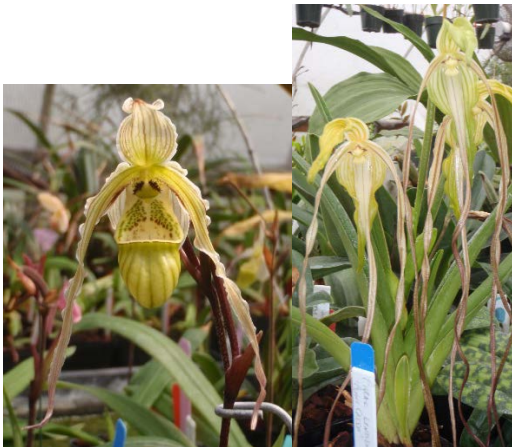
WSO 4520 ecuadorensis x lindenii – Looking for miniature

Carol Kanzer 'St. Leonard Creek' (pearcei x schlimii) – Cute small-growing pink primary hybrid. 2 available. 3.5" pot Division $25