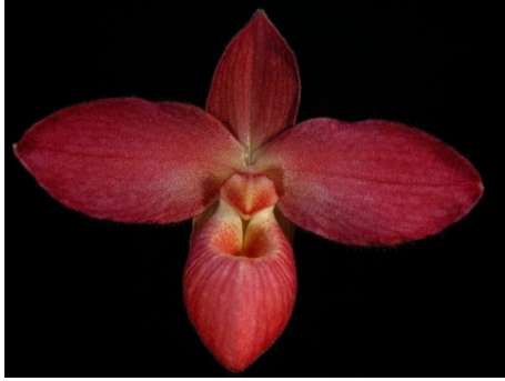
WSO 1832 Fiery Castle 'Glass Slipper' (Elizabeth Castle x Andean Fire) – One of Tony's plants. Have not flowered it yet, but it will be red. 1 available. 6" pot Division $50