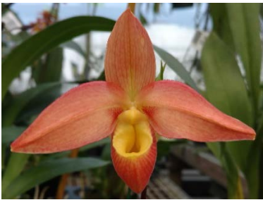
Don Wimber 'Red' (Eric Young x besseae) – Weird color form from the KS/JOE collection. 6" pot BS Division 1 available $65.