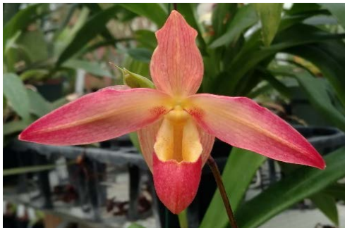
Eric Young (besseae x longifolium) – Orchid Zone breeding. 3 available. 3.5" pot, 7-8" ls seedlings $25