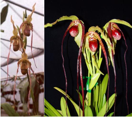
WSO (Fireworks 'April Fool' AM/AOS x humboldtii ) – Long petals expected. 4.5" pot NBS Seedling 1 available $45