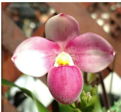
WSO 4603 Anthony Omeis (Spot On 'Rose Revolution' AM/AOS x Pink Panther 'Tony') - A dream cross for miniature/compact plants with deep red to pink flowers with very dark red-pink pouches. Should look like miniature Jason Fischers!! 2.5" pots 4-5" ls seedlings $30; 3.5" pot BS Seedlings $40