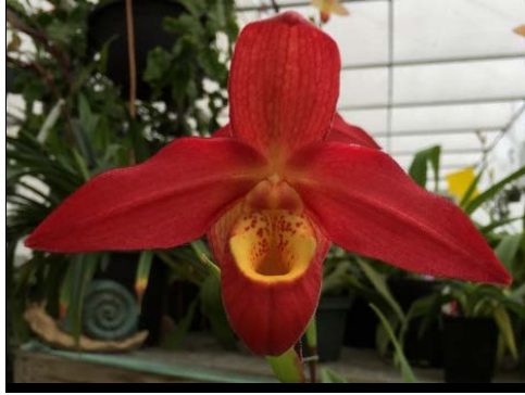
Sunset Glow [4N] 'Poe Valley' (Mem. Dick Clements 'Jersey' FCC/RHS [4N] x Eric Young 'Jersey' FCC/RHS [4N]) – Dark red cultivar that is strong growing and an excellent display plant. 1 available. 6" pot, NBS Division $65