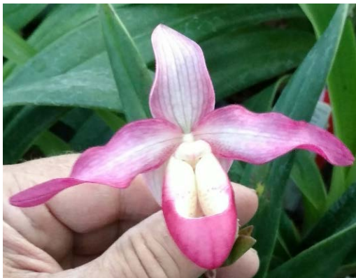
Swift Run 'Little Alaska' (hartwegii baderi x Spot On) – Remarkable compact hybrid with small pink-purple and white flowers. 6" pot large Blooming Size Division $75