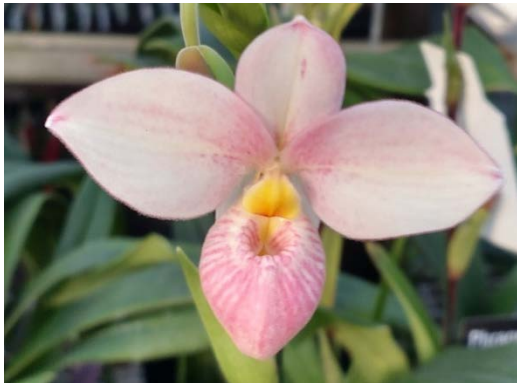
Hanne Popow flavum 'Sterrettania' HCC/AOS (besseae flavum x schlimii) – Terrific cultivar from the Eric Young Orchid Foundation. Good breeder. Strong growing and throws branched inflorescences. First time offered. 1 available 4.5" pot BS Division $250