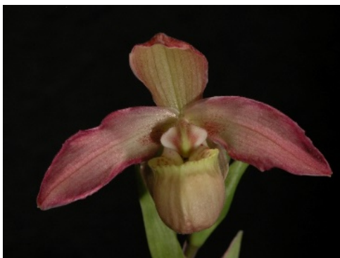
WSO Strawberry Shuffle (Strawberry Rush x Cleola) - 3.5" pots

Creek' HCC/AOS x klotzscheanum - Miniature/compact plants with delightful yellow-salmon flowers with very dark red-pink pouches. Sure to be one of our favorites! Strong growers. 2.5" pot 4-5" Is Seedlings $25; 3.5" pots, NBS seedlings $35