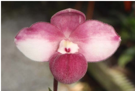
WSO 4876 fischeri ('Joan' AM/AOS x self) - (Ecuador) Rare

- (Ecuador, Peru) Graceful green Ecu-Peruvian species with wavy petals and branching stems. Becoming rare in cultivation. A fine parent for making pinks and whites. 3 available, 2.5" pot, 3-4" ls Seedlings, $25