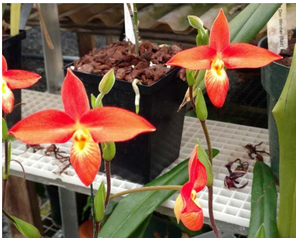
Jersey (besseae 'Esther Nies' AM/AOS x d'alessandroi 'Windy Hill') – Small – medium brilliant orange flowers on branching stems Easy to grow and bloom. 3.5-4.5" pots NBS-BS Divisions $35