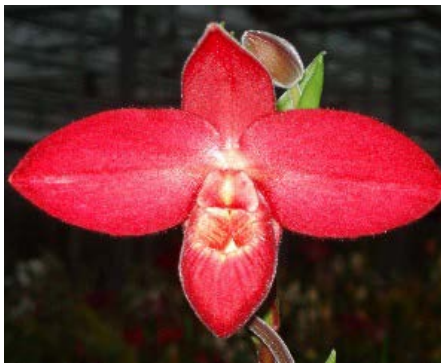
WSO 4479 Jason Fischer (3N) (Mem Dick Clements (4N) 'Catherine' AM/AOS x besseae 'Ozone') - Superb dark red flowers of good size on fast growing plants. Don't miss these stunning show plants! Blooming-size plants will sell for $100+. 2.5" pots 4-5" Is Seedlings $25; 3.5" pots $35