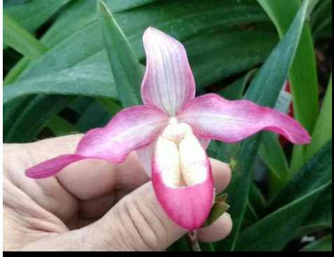
Swift Run 'Little Alaska' (hartwegii baderi x Spot On) – Remarkable compact hybrid with small pink-purple and white flowers. 6" pot Blooming Size Division $65