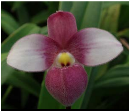
WSO 4145/4159 Pink Panther (schlimii x fischeri) - Miniature plants with delightful two-tone pink and white flowers with very dark red-pink pouches. One of our favorites! Few available. 2.5" pots $25; 3.5" pots NBS Seedlings $35

multifloras with long petals! Very limited. 2.5" pots, 3-4" ls Seedlings $25; 3.5" pots 5-7" ls $35