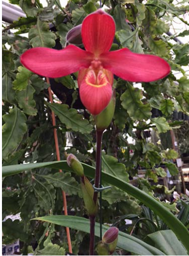
WSO 4740 Andean Fire (lindleyanum 'Kelly Creek' HCC/AOS x besseae) - Remake of a classic solid red parent using superior parents. Looking for dark red flowers on branching stems. These can be spectacular. Easy to grow. 3 available. 2.5" pot Seedlings $25; 3.5-4.5" Seedlings $40