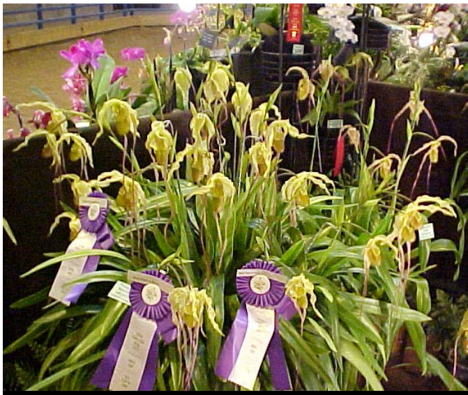
Grande 'Macrochilum' AM/AOS - Wonderful awarded clone! Everyone should have this plant! Division of our CCE/AOS plant! 3 available. 3.5-4.5" pot, NBS Division $50