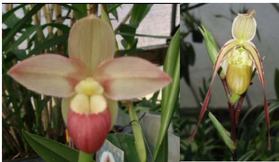
WSO 4179 Rockland Lake (Petit Port 'Pink Ice' (shown) x

Mingoville Morn – Very small plants with pink flowers and some with a yellow pouch. 1 available. 2.5" pot 3-4" Is Seedlings $25; 2 available 3.5" pot BS Seedlings