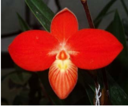
besseae (Select Outcross) (Ecuador/Peru) - From the Orchid Zone.