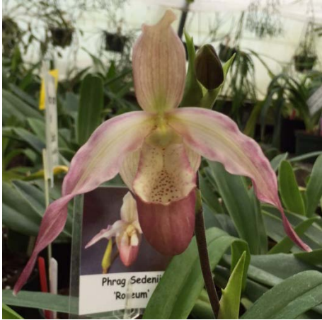
Sedenii 'Roseum' (longifolium x schlimii) – Classic primary that is probably over 100 years old. 3.5" pots, NBS Divisions $25; 4.5-6" pots BS Divisions $35