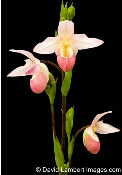
Elizabeth March (3N) 'Broadwaters' CCM/AOS (besseae [4N?] x Sedenii) – One of most impressive show plants. Winner Best Phrag and People's Choice Award at the Paph Forum. Much sought after. First release. 6" pot, BS Division $300