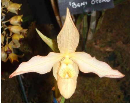
WSO 3975 Olaf Gruss flavum (pearcei x besseae flavum) - Small plants and graceful yellow flowers with salmon highlights are expected. Vigorous multi-growth plants. 3.5" pots BS Seedlings/Divisions Seedlings $15; 4.5" pots BS Divisions $25

WSO 4982 Petit Queillette (besseae x andrettae) – 2.5" pot 3-5" Is Seedlings $25