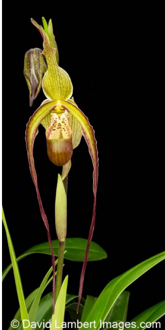
Grande 'Crystelle' HCC/AOS (caudatum x longifolium) – From the Krull-Smith/JOE collection. 2 available. 4.5" pot, BS Division $100; 6" pot BS Division 1 available $125