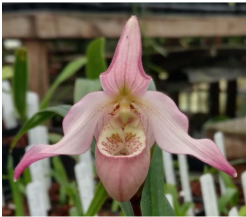
Carol Kanzer 'St. Leonard Creek' (pearcei x schlimii) – Cute small-growing pink primary hybrid. 2 available. 3.5" pot Division $25