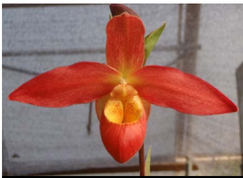
Sunset Glow [4N] 'Kelly Creek' HCC/AOS (Mem. Dick Clements 'Jersey' FCC/RHS [4N] x Eric Young 'Jersey' FCC/RHS [4N]) – Dark red cultivar that is strong growing and an excellent display plant and fertile breeder. 1 available. 6" pot, BS Division $350