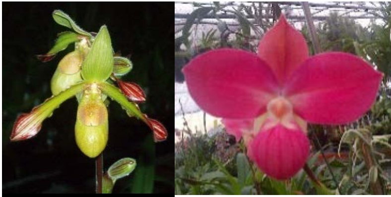
WSO 4230 lindleyanum 'Kelly Creek' HCC/AOS x Fritz Schomberg 'Black Canyon' AM/AOS – Few to be released second generation kovachii hybrid. Great parents. 1 available 3.5" pot NBS Seedlings $50