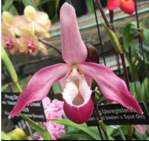
Swift Run (hartwegii baderi x Spot On) – Remarkable compact hybrid with small pink-purple and white flowers. 3.5" pots Blooming Size Divisions $35