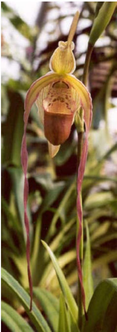
Fireworks 'Starburst' ( Grande x pearcei ) – Terrific medium size plant with long petals and good color. One of Bill's favorites. 4.5" pot BS Division 1 available $75