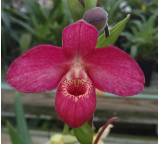
Sue Omeis 'Pride of Mingoville' AM/AOS (Saint's Apprentice 'Carmine Bouquet' AM/AOS x Lynn Evans-Goldner 'Full Circle' HCC/AOS) – Wonderful original WSO hybrid with medium-large rose colored-blooms and branching stems. POM is stunning. Best Phrag in Show at SEPOS in 2017. 2 available 6" pot, BS Division $1,000.