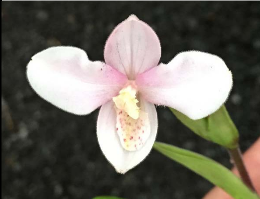
WSO 4815 Saint Ouen 'Ice Queen' JC/AOS x andrettae 'Ghostly' – This is the first release of a string of hybrids we are working on to produce white Phragmipediums. These should be small growing with near-white to white blooms. Limited. 2.5" pots 3-4" Is Seedlings $30; 3.5" pot NBS Seedlings $45