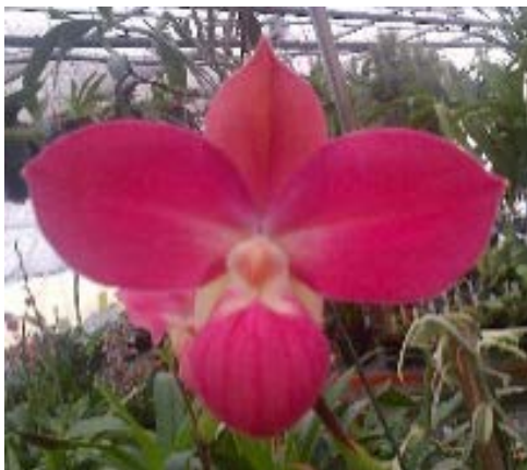
Fritz Schomberg (besseae 'Mega' x kovachii 'Leonardo' FCC/AOS) – The last cross we received from the Orchid Zone. One of the first to bloom received an 85 point AM/AOS this year. 5 available 3.5" pot NBS Seedlings $100