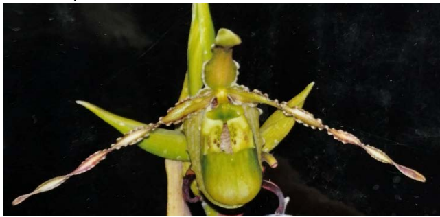
WSO 4696 czerwiakowianum ('Green Ghost' x sib)

- (Ecuador, Peru) Graceful green Ecu-Peruvian species with wavy petals and branching stems. Becoming rare in cultivation. A fine parent for making pinks and whites. 3 available, 2.5" pot, 3-4" ls Seedlings, $25