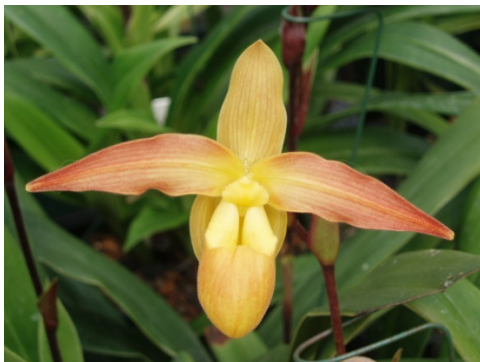
WSO 2702 Raquette Lake (Saint Peter x besseae flavum) - 1 available 2.5" pot 4-5" Is Seedling $25

Plemont (3N) (Hanne Popow (4N) 'Jersey' AM/RHS x d'alessandroi) - 2 available 3.5" pot NBS Seedling $35