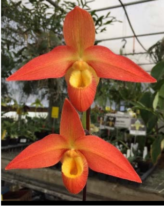
Don Wimber 'D&B' AM/AOS (Eric Young x besseae) – One of our favorite hybrids. From our Florida purchase. 4.5" pot NBS Division $85; 6" pot BS Division 2 available $150.

stunning show plants from our Florida purchase. These were all labeled China Dragon, but are blooming out half China Dragon and half Frank Smith. Either way you win! Orange flowers (China Dragon or pink-purplish flowers (Frank Smith) with long petals usually blooming with 2-3 flowers open on an inflorescence. Awesome prices! 3.5" pots, 8-12" Is Seedling 10 available $25; 4.5-5" pot NBS-BS Seedling 10 available $45; 6" pots BS Seedlings 10 available $65