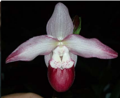
WSO 4176 Wild Horse Valley x Hat Creek - Wild Horse Valley is Petit Port x Barbara LeAnn, and Hat Creek is hartwegii baderi x fischeri. With fischeri on both sides, we are looking for small, compact-growing plants with rose-raspberry flowers. Limited. 2.5" pot 4-5" ls Seedlings $25; 3.5" pot $35