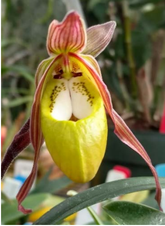
Phrag klotzscheanum - (Venezuela) The most diminutive of the Phrag species. Totally charming and an interesting parent for miniature Phrags. Limited 2.5" pot, 3-4" Is Seedlings, $35