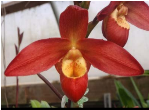
Sunset Glow [4N] (Mem. Dick Clements 'Jersey' FCC/RHS [4N] x Eric Young 'Jersey' FCC/RHS [4N]) - As the name suggests, these will bloom out in rich sunset tones from salmon pink to raspberry to deepest red. Flowers should be large with horizontally-held petals. 1 available. 6" pot, BS Division $65