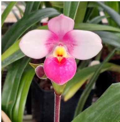
WSO 4145/4159 Pink Panther (schlimii x fischeri) - Miniature plants with delightful two-tone pink and white flowers with very dark red-pink pouches. One of our favorites! Few available. 2.5" pots $30; 3.5" pots BS Seedlings $35