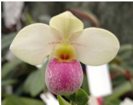
longifolium var. album x manzurii – Phragmipedium manzurii (pictured) is a delightful small-growing species with the potential to contribute to breeding pale and possibly white Phrags. Crossed with the alba form of longifolium, this could come to fruition soon. Few to be released. 2.5" pot 4-6"ls Seedlings $35