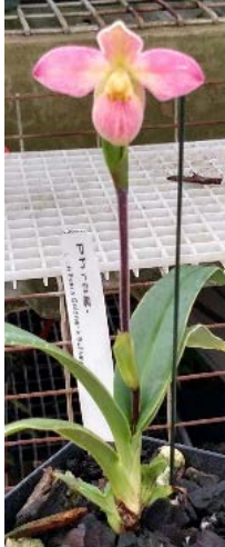
WSO 4132 Little Deschutes (Lynn Evans-Goldner 'Full Circle' HCC/AOS x Bullseye 'Penns Creek' AM/AOS) - Looking for shapely pink flowers with rounded petals, very small plants and branching inflorescences. Some have bloomed almost white. Bullseye is Hanne Popow x Lynn Evans-Goldner. These are blooming on 4-5" leaf span! 3.5" pots BS Seedlings $35 each

WSO 3975 Olaf Gruss flavum (pearcei x besseeae flavum) - Small plants and graceful yellow flowers with salmon highlights are expected. Vigorous multi-growth plants. 3.5" pots BS Seedlings/Divisions Seedlings $15; 4.5" pots BS Divisions $25