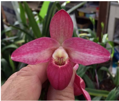
WSO 3231 Three Dollar Bridge 'Madison River' (Saint's Apprentice x Hanne Dale) – Medium size plant with lovely dark pink flower. 4.5" pot BS Division $65