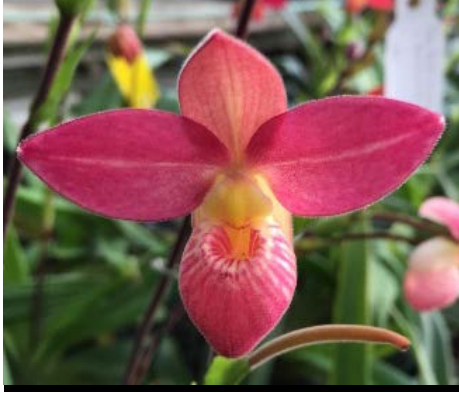
Hanne Popow 'Pretty in Pink' HCC/AOS (besseae x schlimii) - Original cross from the Orchid Zone. This cultivar has a solid pink-raspberry coloration. Strong growing and throws branched inflorescences. 2 available. 4.5" pots BS Divisions $75; 1 available 6" pot BS Division $100