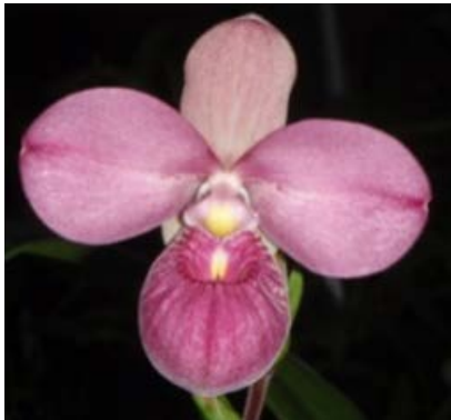
Eumelia Arias 'Poe Creek' (schlimii x kovachii) - Dusty rose-purple flowers with good form on floriferous plants. These are from the Eric Young Orchid Foundation breeding. 1 available 6" pot BS Division $75