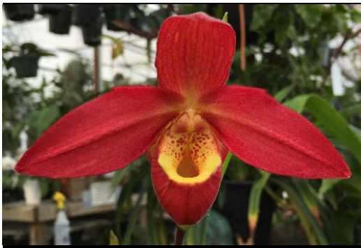
Sunset Glow [4N] 'Spring Creek' (Mem. Dick Clements 'Jersey' FCC/RHS [4N] x Eric Young 'Jersey' FCC/RHS [4N]) – Dark red cultivar that is strong growing and an excellent display plant. 1 available. 6" pot, NBS Division $75