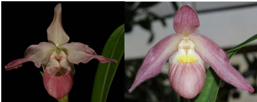
WSO 4697 Pastel Echo x

WSO 3975 Olaf Gruss flavum (pearcei x besseeae flavum) - Small plants and graceful yellow flowers with salmon highlights are expected. Vigorous multi-growth plants. 3.5" pots BS Seedlings/Divisions Seedlings $15; 4.5" pots BS Divisions $25