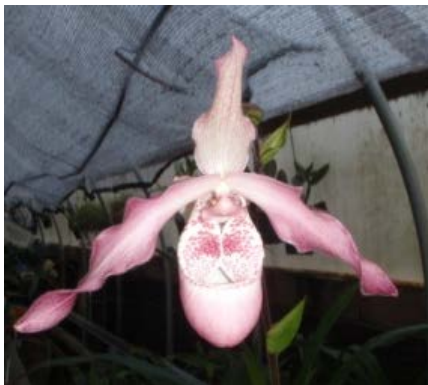
WSO 4798 lindleyanum 'Kelly Creek' HCC/AOS x kovachii 'Splendid' - Beautiful species from Brazil and Guiana produces many flowers over time on branching inflorescences, crossed with a bodacious kovachii. 'Kelly Creek' received a 78 point HCC/AOS in December, 2013. These will have large pink blooms on tall-branched inflorescences on medium-large plants. Easy! Fast-growing. 2.5" pots 3-4" ls Seedlings $35 each; 3.5" pots 5-7" s Seedlings $40