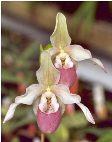
Sedenii 'Candidulum' HCC/AOS (longifolium x schlimii album) – One of our favorites. Beautiful. 3.5" pot NBS Division $50; 4.5" pots 2 available BS Divisions $55; 3 available 6" pot BS Divisions $65