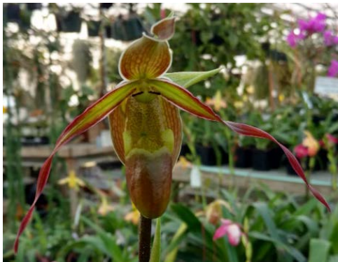
longifolium 'Windy Hill's Midnight' AM/AOS - Division of the second of two best longifoliums we know of. Great color! 4.5" pot NBS Division $75; 6" pot BS Division $85

longifolium var. gracile 'Birchwood' AM/AOS - This diminutive species is easily distinct from the Phrag hartwegii var. baderi , as the staminode has "eye-brows". There are other differences, as well. 1 available. 4.5" pot BS Division $75