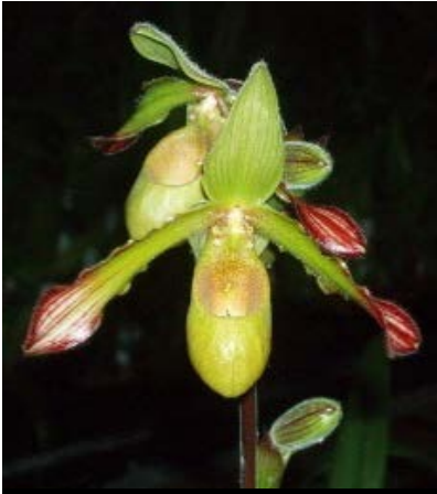
Phrag lindleyanum ('Kelly Creek' HCC/AOS x sib) – (Venezuela) We love this species. Beautiful branching inflorescences. Medium size plant 2.5" pots, 4-5" Is Seedlings $20; 3.5" pots 7-9" Is Seedlings $35