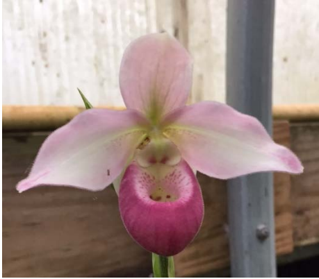
Cardinale 'Birchwood' AM/AOS (Sedenii x schlimii) - Grows into terrific specimen plants with branching stems and pink flowers. Everyone should have this classic hybrid! 1 available 4." Pot $50; 1 available. 6" pot BS Division $65