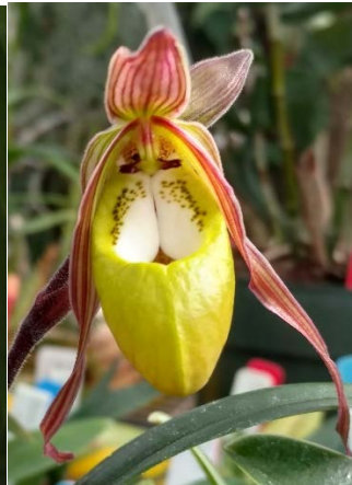
WSO 5000 Spot On 'Kelly

Creek' HCC/AOS x klotzscheanum - Miniature/compact plants with delightful yellow-salmon flowers with very dark red-pink pouches. Sure to be one of our favorites! Strong growers. 2.5" pot 4-5" Is Seedlings $25; 3.5" pots, NBS seedlings $35