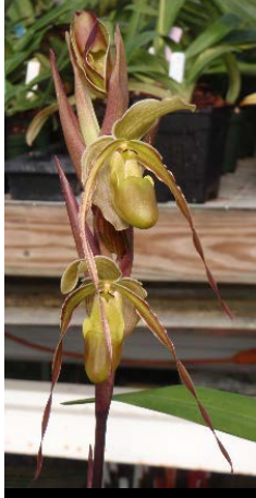
longifolium 'Woodstream' AM/AOS - Division of our superb Ecuadorian clone. One of the two best longifoliums we know of, and the only one that throws a branched inflorescence. 4.5" pot NBS Division $75; 6" pot BS Division $85