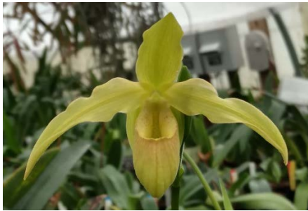
Franz Glanz (richteri x besseae flavum) - 1 available 3.5" pot BS Division $35