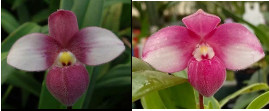
WSO 4944 Asendorf Rose

(Pink Panther x fischeri) - Miniature plants with delightful two-tone pink and white flowers with very dark red-pink pouches. One of our favorites! Few available. 2.5" pots $25