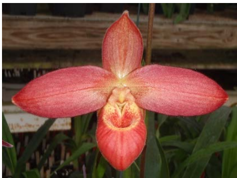
WSO 3992 Reed Creek (Bald Eagle Creek x Pink Panther) – Bald Eagle Creek is Saint's Apprentice x Barbara LeAnn. One available. 6" pot BS Division $45