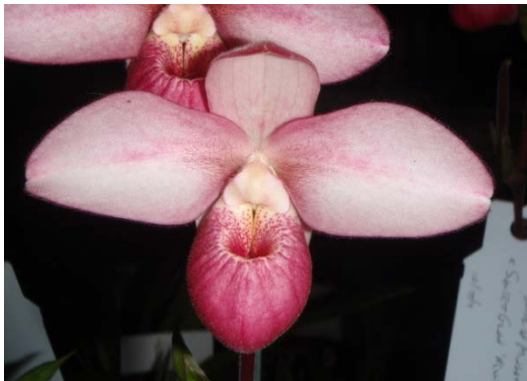
Sue Omeis 'Black Canyon' (Saint's Apprentice 'Carmine Bouquet' AM/AOS x Lynn Evans-Goldner 'Full Circle' HCC/AOS) – Wonderful original WSO hybrid with medium-large rose colored-blooms and branching stems. - 1 available 4.5" pot BS Division $250