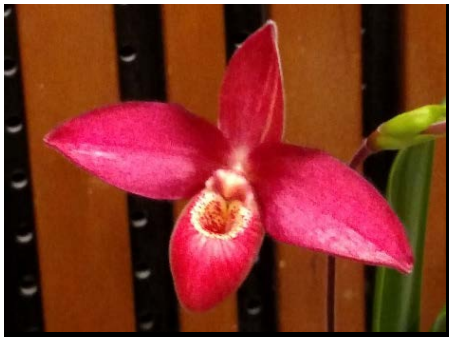
Fox Valley Fireball (Barbara LeAnn 'Select' x Rosalie Dixler' Fox Valley' AM/AOS) – Compact-growing red-flowered hybrid. 2 available. 2.5" pots BS Seedlings $25