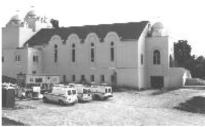
St. Mary & St. Abraam Coptic Orthodox Church, St. Louis, MO 63146, USA (Dedicated: 1 OCT 1994)

St. Mary & St. Abraam Coptic Orthodox Church 1843 Ross Ave. St. Louis, MO 63146