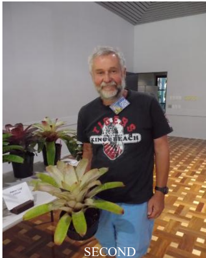
Vr. Greenline x Glutz