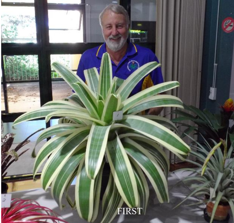
Alcantarea White Star (12 Votes) - Stan Walkley