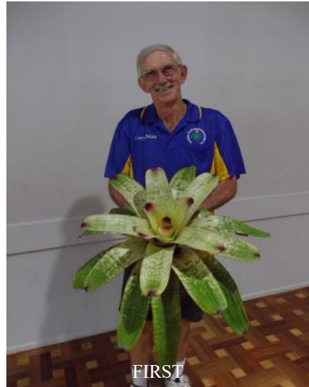
Vr. Forrest Hybrid