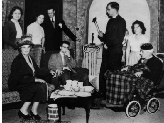
The Devil was Sick.