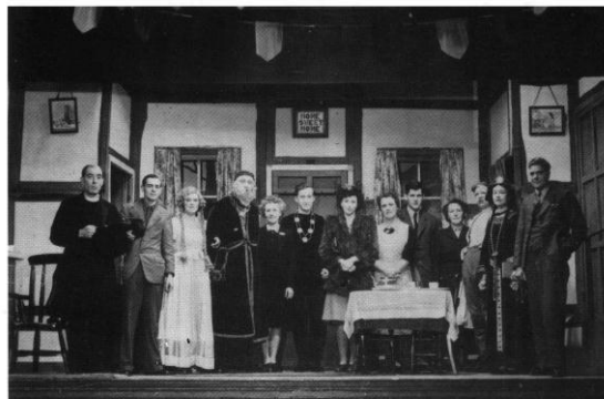
THE CAST OF "WITHOUT THE PRINCE"