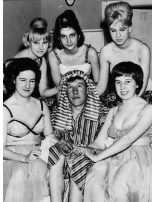
Brides of March.

Pic and Feature Page 1, 13 Apr Sandbach Chronicle. Pic and Feature Page Unkn, 20 Apr Sandbach Chronicle.