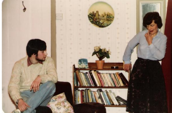
Murder for the Asking.