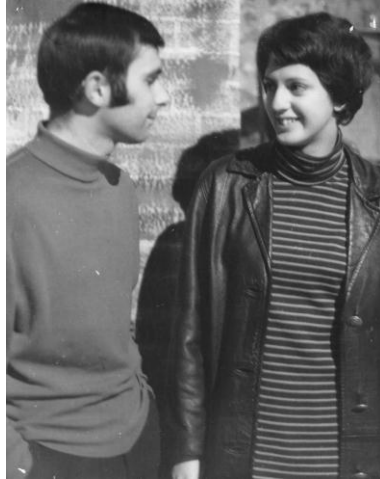
All in Good Time.