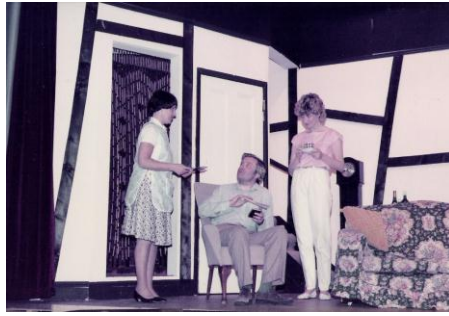
Love from a Stranger