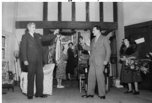
A Quiet Weekend