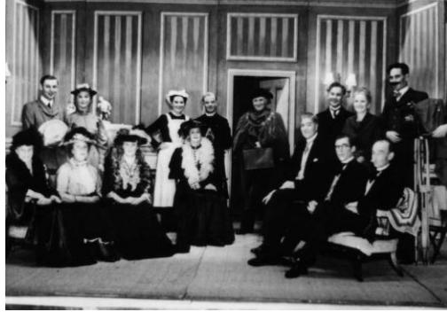
When we are Married.