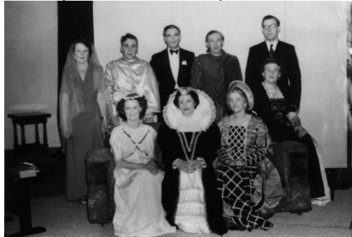
A Murder Has Been Arranged.