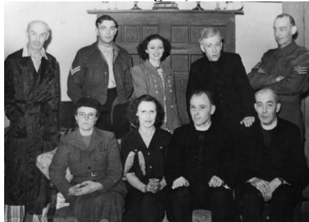
See How they Run.

Pic and Feature Page 1, 23 Nov 1951 Sandbach Chronicle