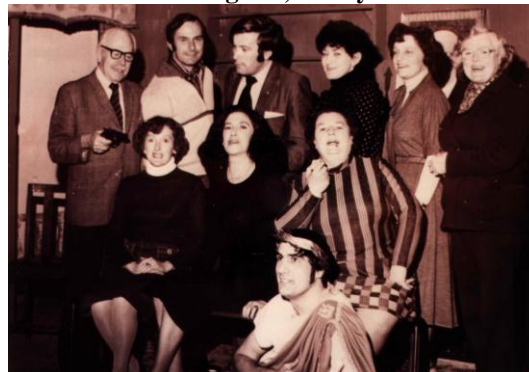
A Tomb with a View.

Pic and Feature Page 48, 2 May Sandbach Chronicle.