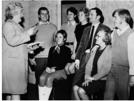
Spring and Port Wine.