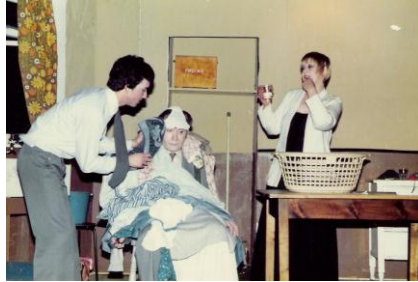
Absurd Person Singular

Feature Page Unkn, 12 May Manchester Evening News. Feature Page Unkn, 12 May Evening Sentinel. Pic and Feature Page Unkn, 13 May Crewe Chronicle. Pic and Feature Page Unkn, 14 May Sandbach Chronicle. Pic and Feature Page Unkn, 20 May Crewe Chronicle.