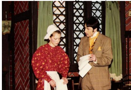
(Ladies in Retirement)

Feature Page Unkn, 21 Feb Crewe Chronicle Feature Page Unkn, 28 Feb Evening Sentinel Feature Page Unkn , 1 Mar The Advertiser Pic and Feature Page 7, 1 Mar Sandbach Chronicle. Pic and Feature Page 8, 7 Mar Crewe Chronicle. Feature (Review) Page Unkn, 7 Mar Crewe Chronicle (See above)