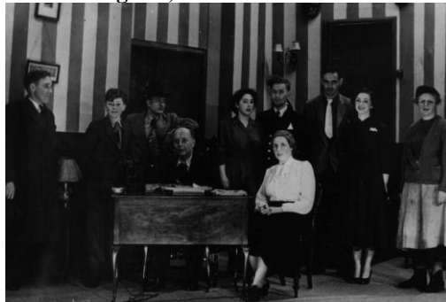
Shop at Sly Corner