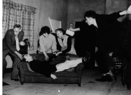
Friends and Neighbours.