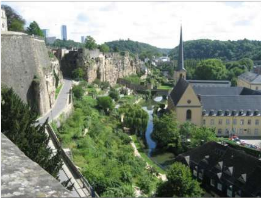
The City of Luxembourg with Bock Promontory (left side)