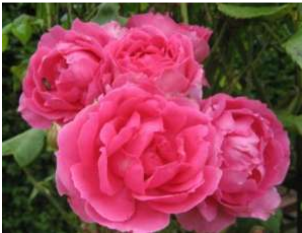
'Parade' (Boerner 1953)

This romantic garden is part of the European project Gardens without Limits, which is a unique network of currently 23 gardens in Germany, Luxembourg and France. The Garden of the Senses shows very atmospheric garden rooms, in which beautiful variations of gardening are realized: a small collection of roses such as the rarely found climber 'Parade' (Boerner 1953), a garden of fragrances or a touch garden that allows tactile contact to the plants. Also very impressive were stone-garden areas with rare dry lawn plants. It was a very good place for a short and relaxing walk and thus a successful start to our journey.