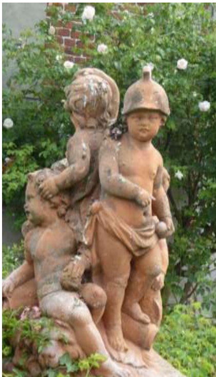
Sculptures in the historic rose garden in front of the Noisette rose 'Madame Alfred Carrière'