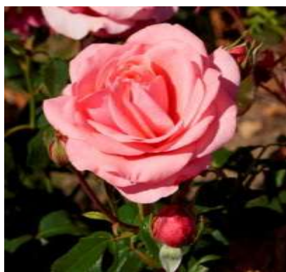
'Elaine Paige' HT Poulsen (POUht008)

Torben Thim on the 'raison d'être' of the rose: To bloom with delight, because that is all it is capable of, except to drink the dew, feel the nourishment of the soil, bring joy, accompanied by a scent which makes even the strongest of men swoon. The rose is a contrast to science, which tries to explain the forces and order of Nature. Neither philosophers nor physicists have succeeded in penetrating the inscrutable nature of the rose by tampering with its mental life – why is the rose the fairest flower of all? It just is. Over two millennia ago, a student of the Greek philosopher Epicurus asked, "What is beauty?" and Epicurus answered, "Get up and go into the garden. To the left is a rose bush. There you'll find the answer."