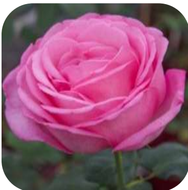
'Grace de Monaco' (1956) (MEImit)