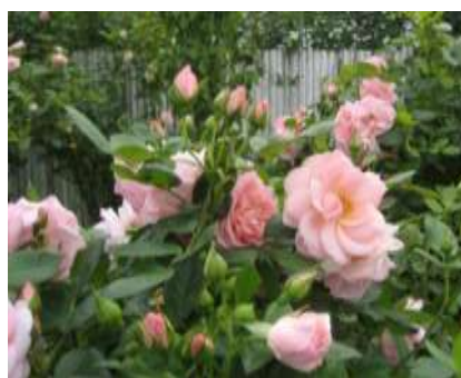
'Astrid Lindgren' Floribunda Poulsen (POUlf)