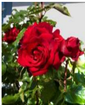
'Ingrid Bergman' HT Poulsen (POUIman)