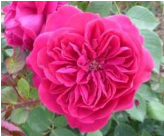
'Reine Marguerite d'Italie' (Soupert & Notting 1904)