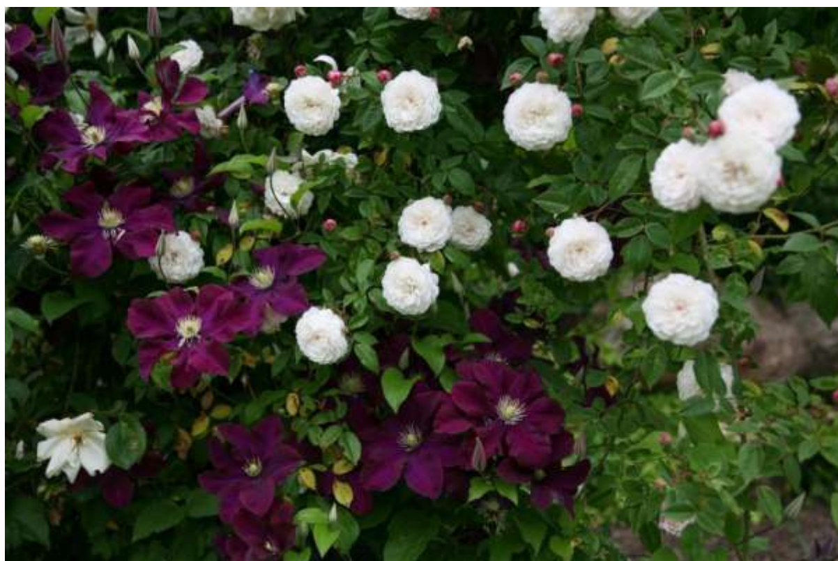
‘Félicité et Perpétue’ intertwined with Clematis Warzaska Nike