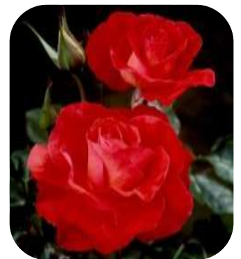
'Prince de Monaco'™ POUlart (1983) This Poulsen rose was named for Prince Rainier III on the occasion of his jubilee in 1999 after 50 years of rule.