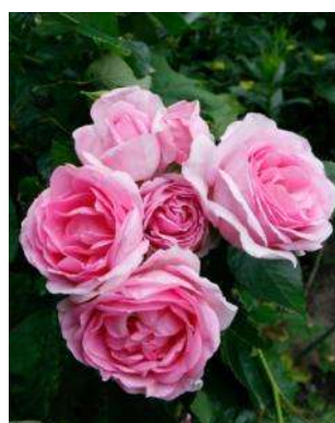
'Ghita Renaissance' (Syn 'Mum in a Million (POUbella)

This is quite true! The rose is the fairest of flowers. The fact that Poulsen Roses have succeeded in breaking the code by creating unique, healthy, durable and fragrant roses has greatly contributed to secure the popularity of the rose in future.