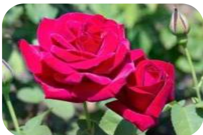
'Prince Rainier III'