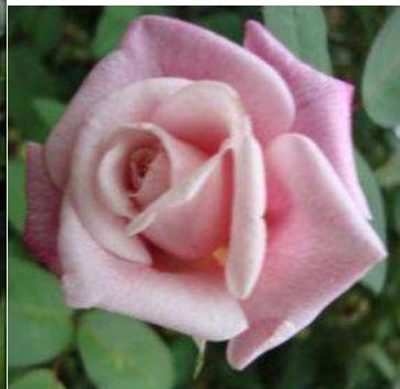
'Mme. Antoine Marie'