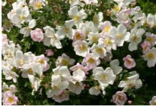
'Katrín Viðar'