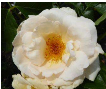
'Hélène de Gerlache' (Lens 1982)

We were able to discover many wonderful roses that are not often found in other rose gardens. For example, known personalities of the world of roses are found here, such as 'André Brichet' (DVP 2003)(husband of Helga Brichet) or the enchanting Hybrid Tea 'Hélène de Gerlache' (Lens 1982).(daughter of Lily de Gerlache de Gomery).But also many older rose varieties such as the Hybrid Teas 'Tiffany' (Lindquist 1953) or 'Grange Colombe' (Guillot 1912) could be admired.