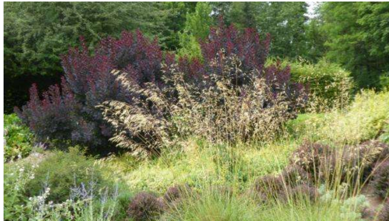
Garden of the Senses

Sunday morning, 16 th July, 2017: All the travel-loving rose friends of the Gesellschaft Deutscher Rosenfreunde (Society of German Friends of Roses) arrived on time (8.00 am) at the meeting point Frankfurt Central Station, where our bus was waiting. The luggage was quickly stowed and we could immediately start on our way to our first destination, the Garden of the Senses in Merzig (Saarland).