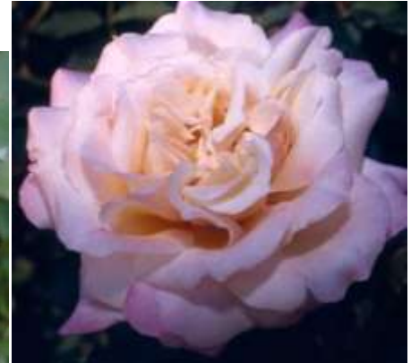
'Mrs. Dudley Cross'

It will be noted that the majority of this Earth-Kind® roster is composed of shrubs and Old Garden Roses, and further that nearly all varieties are out of patent in the U.S. ('Knock Out', introduced in 2000 will soon be out of patent). While inadvertent, this has proven to be a boon to the many small and primarily own-root nurseries in the country that carry many of these varieties. For a variety of reasons, all Earth-Kind® trials are conducted with own-root plants, and all Earth-Kind® Roses sold under that name must be own-root as well. A number of 21 st century hybrid teas and floribundas were part of the test group but none apparently made the grade. (Note: The American Rose Society has determined that 'Caldwell Pink' is synonymous with 'Pink Pet' ).