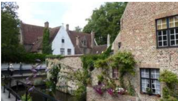
City of Bruges