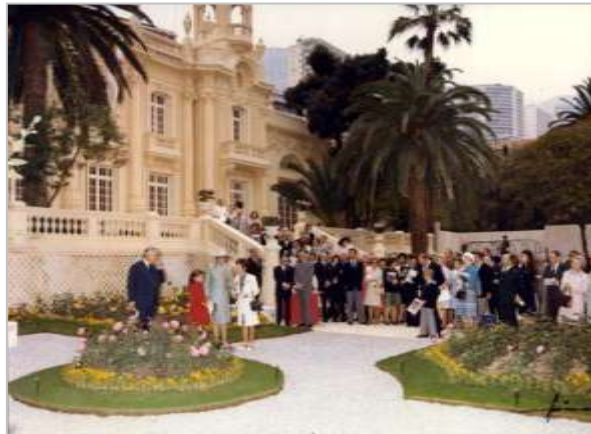
Francis Meilland Rose Garden - 1976