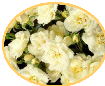
'White Cover' syn.'Kent' POUIcov)