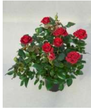
'Berleburg, Bewitched' (POUIbella)

Paradoxically, we all focus on historic and modern garden roses, at a time when pot roses are gaining popularity with the population as a whole. You find them in every home, both indoors and outdoors, in the wake of well-known garden roses – now in the fast track. Pot roses are sold in all pot sizes for use indoors as well as outdoors and are sold in garden centres, as well as in DIY-stores and supermarkets. In the trade, pot roses are easier to handle than garden roses. They do not require the same tender care as garden roses. And then they are cheaper to buy – and consequently fill the space in balcony boxes and on patios, thus appealing to a wider and younger group of customers.