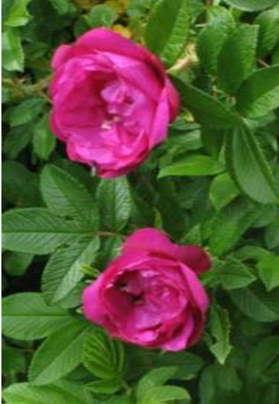
'Logafold' by Jóhann Pálsson