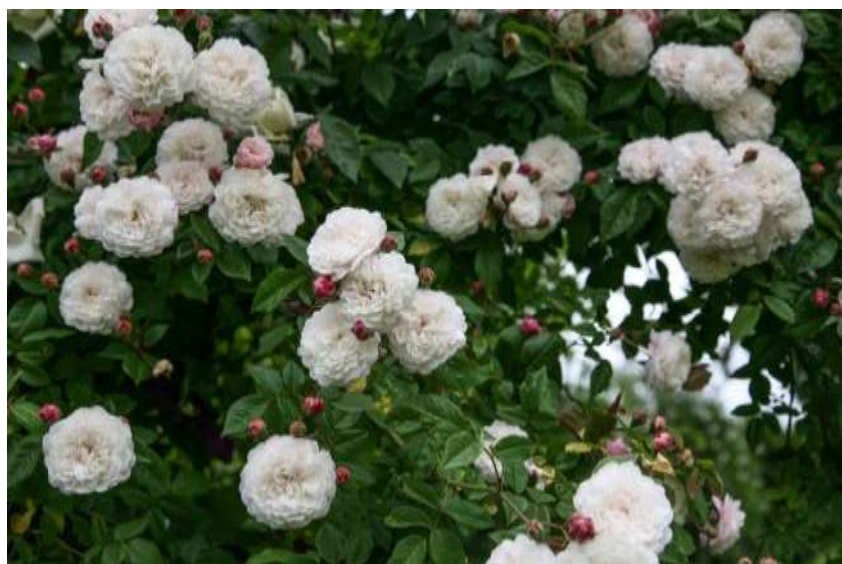
Cream-white multi-petaled small rosettes - 'Félicité et Perpétue'

Sometimes Floribunda and Hybrid Tea climbers produce a sport as a climber, but the other way around, from a climbing rose to a bush rose is a rarity.