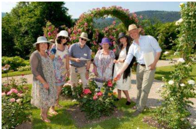
An international group in Baden-Baden with rose experts from South Africa, New Zealand, Germany, Denmark and the USA -

Another important work as Chairman of the Rose Trials Committee is the collaboration with the Breeders' Club. I attended two meetings in Aire-la-Ville near Geneva in March 2017 and November 2017. In the future the cooperation of the Breeders' Club and the International Rose Trials Committee will be important to establish new rose trials. There are new ideas for new rose trials in Switzerland, Italy, England, China and Argentina under the umbrella of the World Federation of Rose Societies. The definition of guidelines for International Rose Trials could be an important base for the work of the committee in future.