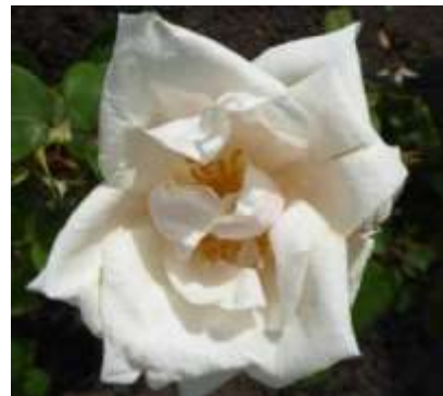
'Grange Colombe' (Guillot 1912)