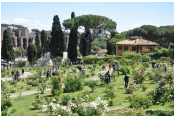
Novelty Rose Garden in Rome