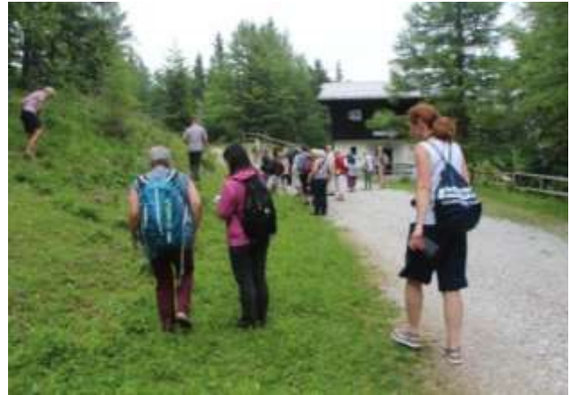
Delegates in Slovenia on an expedition looking for wild roses