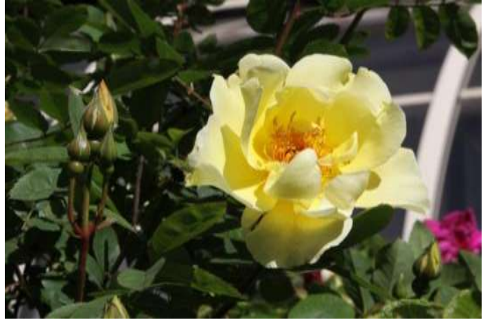
A ravishing 'Aicha' basking in the rare sunrays of 2013 (VL)

There were however notable exceptions in the spinosissima family. Thus the rather recently Swedish bred 'Huldra' ('Poppius' × Rosa rubiginosa L.) remained in flower unaffected by the rain from early July until end of September, showing its relationship to its 18th century hardy mother 'Poppius' of pimpinellifolia origin. Another good and more unexpected performer was the Danish born 'Aicha' from the fingers of the legendary breeder Valdemar Petersen. A few days of sunshine in late July produced a rich flush of golden flowers on 'Aicha' that kept long into the cloudy period that followed. A third exception was the Canadian 'Kakwa' bred by John Alexander Wallace which gave a real show of full and fragrant flowers. Finally a Finnish found spinosissima-rose named 'Linnanmäki' gave a splendid show of large, cream-white, single flowers for an extended period and repeated the show accompanied by black hips and splendid leaf colours in the late fall.