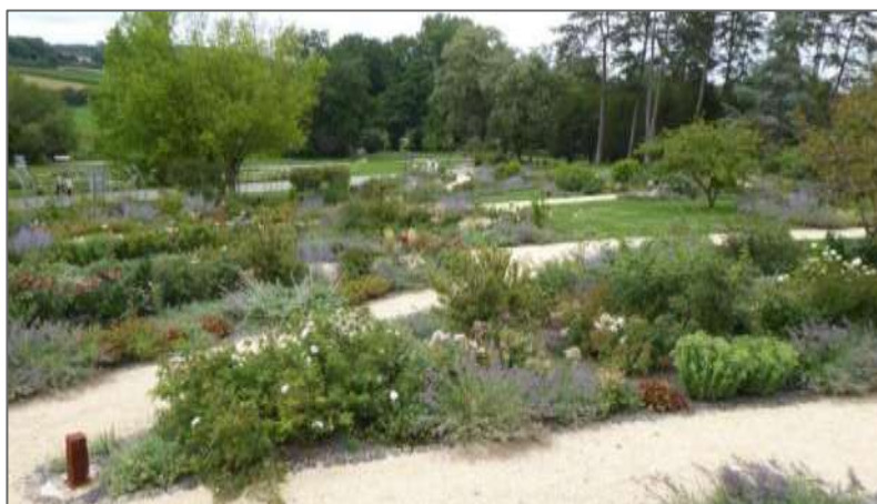
Rose Garden in Mondorf-les-Bains

This romantic garden is part of the European project Gardens without Limits, which is a unique network of currently 23 gardens in Germany, Luxembourg and France. The Garden of the Senses shows very atmospheric garden rooms, in which beautiful variations of gardening are realized: a small collection of roses such as the rarely found climber 'Parade' (Boerner 1953), a garden of fragrances or a touch garden that allows tactile contact to the plants. Also very impressive were stone-garden areas with rare dry lawn plants. It was a very good place for a short and relaxing walk and thus a successful start to our journey.