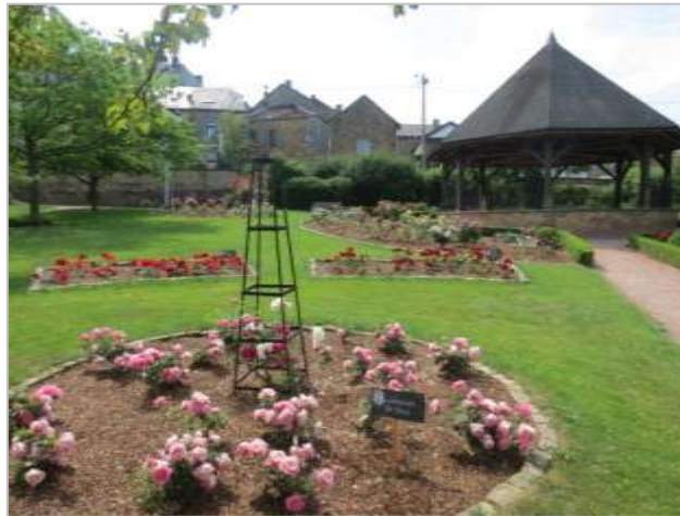
Rosarium Pierre Joseph Redouté