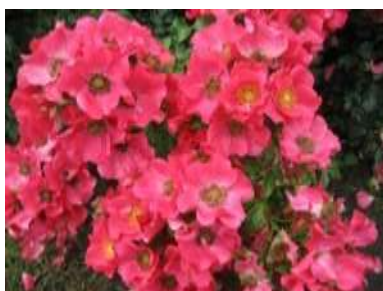
'Stadt Rom' (Tantau 2000)

Due to the combination of disease-resistant varieties with the ADR-predicate, the romantic and natural-looking plant can be maintained completely organically, i.e. without the use of chemical plant protection compounds. Part of the biological protection measures - a freewheeling, busy chicken flock accompanied us during our visit at every step. All roses looked strong and healthy, their abundant blooms called for a lot of enthusiasm. Climbing roses are attached to rose arches made from tall willow branches and reinforce the natural impression of the garden.