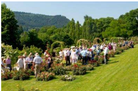
The beautiful Rose Trial garden Beutig in Baden Baden in June 2017

In the triennial from 2015 to 2018, I attended International Rose Trials in Monaco, Lyon, Paris, Saverne, The Hague and Baden-Baden. Many International Rose Trials developed well with a huge number of rose novelties and new rose breeders. Unfortunately the organizers of rose trials in Geneva in Switzerland, Monza in Italy, Baden in Austria and St. Albans in England stopped their rose trials. The reasons for the decisions to stop organizing trials might be different in the four cities, but the regrettable development could be an indicator for the current crises of economy, of selling roses and of rose societies in Europe. Nevertheless in twenty-five places in different parts of the world international expert judging of rose novelties is still taking place. Eleven of these judging panels use the Standard Criteria of the World Federation of Rose Societies. The trials that have adopted the criteria are marked on the WFRS website.