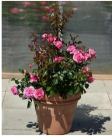
'Isabel 2008 Hit (POUIpah053)