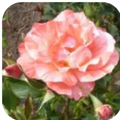
'Grimaldi'® Delstor (Delbard 1997)