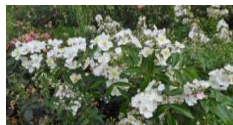
'Europa Nostra' (Vissers 2012)