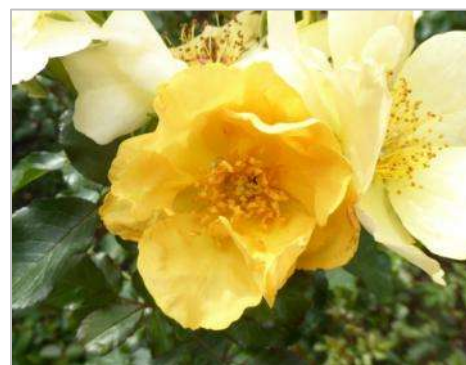
'Coloma' (Vissers 2015)