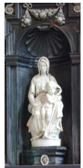
Bruges Madonna (Michelangelo 1505)

After this lovely impression of the current state of rose growing in Belgium, we took the opportunity to visit the picturesque city of Bruges, which was located just next door. In an entertaining city tour we got to know the excellently preserved medieval town centre (UNESCO World Heritage Site since 2000) and enjoyed the atmosphere around the romantic canals.