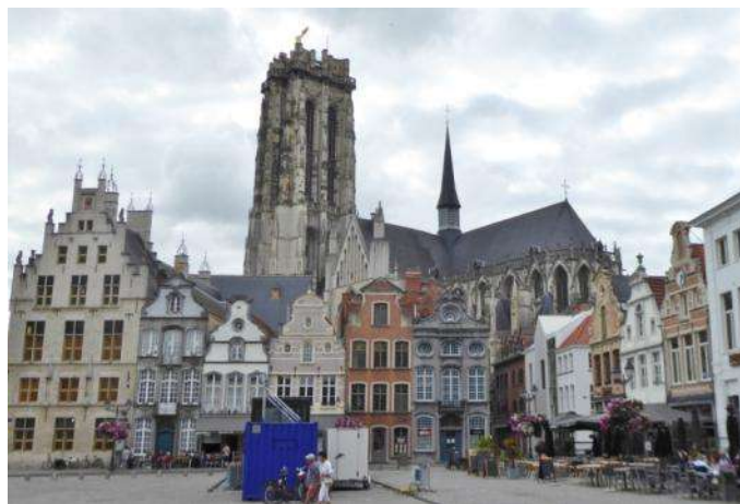
St. Rumbold's Cathedral and old town houses in Mechelen

We became acquainted with Mechelen through a tour with a very eloquent, informative and knowledgeable city guide. From him we learned that the grandfather of the composer Ludwig van Beethoven was born here. Among the most important monuments are St. Rumbold's Cathedral with its 98 m high but unfinished bell tower, old townhouses with magnificent facades, partly from the 15 th century and the Large Beguinage. The Beguins were Christian communities of women living together in the Beguinage. Compared to monastic communities, they differed in the fact that women were able to leave the community and get married. The buildings are of simple, appealing architecture, and form atmospheric ensembles.