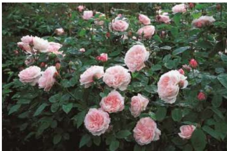
'Redoute' (AUSmary) – David Austin sport of 'Mary Rose'

In 1786, Redouté started working at the National Museum of Natural History before leaving France in 1787 to study plants at the Royal Botanic Gardens at Kew, near London. Returning to France in 1792, he was employed by the French Academy of Sciences and in 1798, he became the Patron of Empress Josephine and later became her official artist until her death in 1814. After some difficult years, he was appointed a master of draughtsmanship for the National Museum of Natural History in 1822 and became a Chevalier of the Legion of Honour in 1825. Redouté died suddenly in 1840 and was interred in Père Lachaise Cemetery.