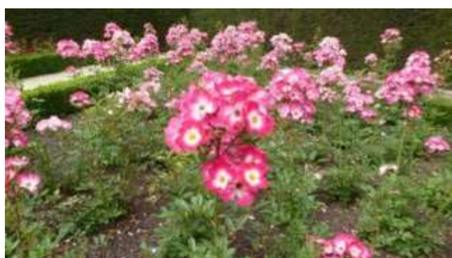
'Bukavu' (Lens 1998)