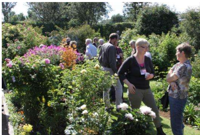
The Nordic Rose Weekend was hosted by Iceland on a sunny July weekend in 2012