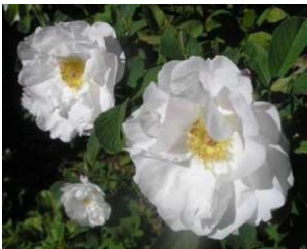
'George Will' a lovely and hardy rose in Iceland