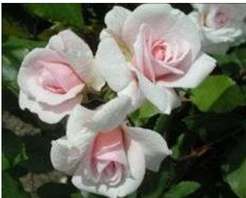
'Mlle. Cecile Brunner'