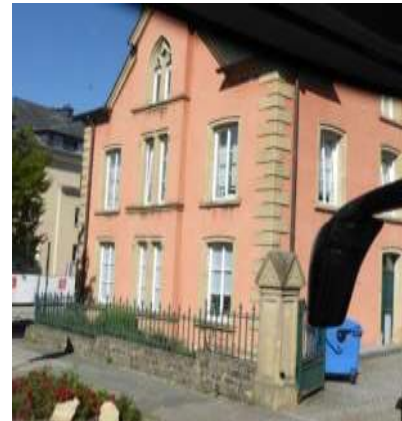
House of the rose breeder Soupert