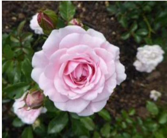
'Rousefrënn' (Zyla 2015)