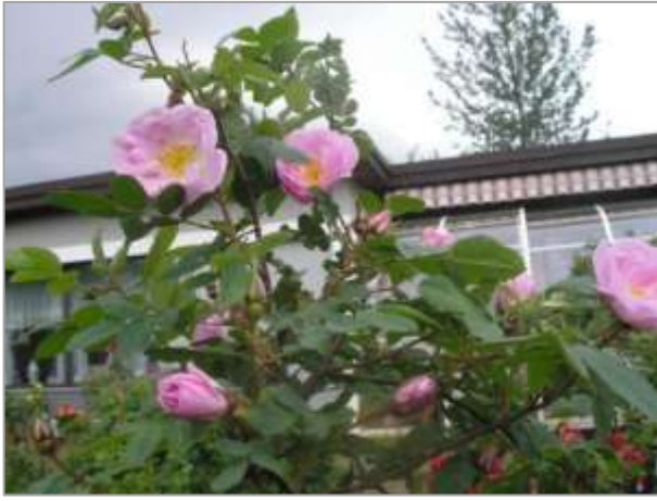
The Swedish beauty 'Huldra' did not let rain and cloudy sky deter its blooming