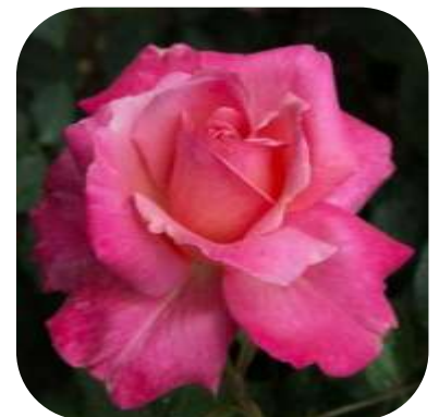
'Stephanie de Monaco' (1971) (MEYpink) (syn. 'Portrait')

Stephanie de Monaco is the youngest child of Rainier III, Prince of Monaco and Princess Grace of Monaco, and the sister of Albert II, Prince of Monaco, and Caroline.