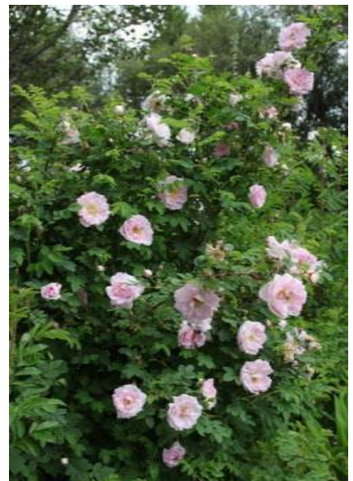
'Ruskela' is a Finnish foundling that "has got talent"!

Finns have since the early eighties done a lot of work in identifying and classifying roses that have survived a harsh and variable climate which in some ways resembles that of Iceland, especially in the early spring and summer. In 2007 members of our Rose Club visited Finland and brought back information which led to the import of a number of varieties that have since proved quite successful in Iceland. Roses have been cultivated in Finland over several centuries, originally by the Swedish and later Russian upper classes under their respective periods of rule. In later years Finns themselves have rediscovered old and hardy varieties as well as spontaneous newcomers that the bees and the birds have generated, often in the most unusual locations such as parking lots and railway stations. One such rose is 'Ruskela' named after the town in which it was found. This spinosissima variety does normally very well in Iceland as does 'Ristinummi', a probable natural spinosissima × rugosa cross named after the railway station where it was found.