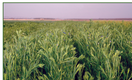
Fig. 1. Flax at early bloom growth stage.