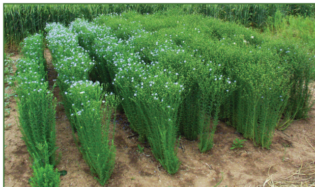
Fig. 2. Impact of planting date on flax flowering and maturation. Planting dates of Nov. 8, Nov. 30, Dec. 4, Dec. 18, Jan. 3, Jan. 18, Jan. 30 and Feb. 15 from right to left. Picture taken on April 4, 2008 in College Station.

Sow flax early enough that the plants will become well established before freezing temperatures occur. After plants have branched at the crown, cold-hardy varieties can withstand much lower temperatures without serious injury. Avoid sowing flax too early in the fall, or late spring frosts may damage the crop at the bloom stage. In South Texas, when moisture conditions permit, plant between November 10 and December 10. In this area, flax seeded after January 1 usually produced lower yields than December seedings. If moisture is available, October 15 to October 30 is an ideal time for planting flax in the Temple area. See Fig. 2 for an example of the effect of planting date on flowering date.