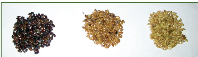
Fig. 8. Brown-seeded (left) and yellow-seeded flaxseed (center and right).

Flax is a self-pollinated crop, and the seed is produced in a boll or capsule. A complete boll can have ten seeds, although the average is about six. Seeds can be brown, golden or yellow (Fig. 8). Yellow-seeded varieties are more susceptible to seed decay and seed damage because of their thinner seed coat. For this reason, yellow-seeded varieties usually have less seedling vigor. Most flax varieties have blue flowers, though some have white flowers.