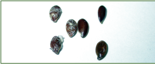
Fig. 10. Weathered flaxseed (left) due to exposure to wet conditions before harvest.

Flax harvested for seed must be handled more carefully than most other crops because cracking frequently reduces germination. Concaves and cylinder speed should be adjusted as frequently as necessary to prevent cracking and injuring the seed. Yellow-seeded varieties are more susceptible to seed damage because of their thinner seed coat. To minimize damage, rubber roller attachments are available for harvesting planting seed. Flax seeds are small and slippery, so equipment and storage facilities must be free of holes and cracks. As with other high oil content crops, storage time should be minimized.