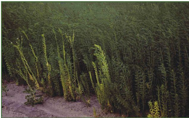
Fig. 7. Plants with aster yellows.

Control: There are no resistant varieties.