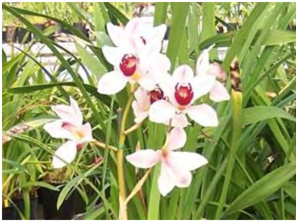
Mericlone plant of Cym. Sussex Court Registered Dec. 22, 2011 with parents unknown by M. Sagisi