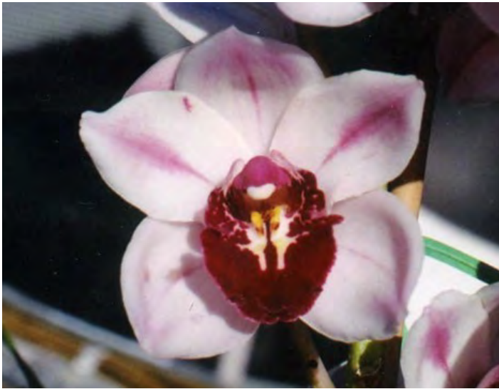
Mericlone Cym. Sussex Court 'Not Peace' as sold by Gallup & Stribling in Nov. 2005

When the mericlones of Cym. Sussex Court 'Not Peace' were released in 2005-06 season, another commercial grower purchased a plant directly from the G&S nursery. When it first bloomed, one original plantlet had developed a peloric mutation of the petals. The owner of the nursery immediately mericloned the mutation of the mericlone Cym. Sussex Court 'Not Peace'. Not aware of the 2-plant potting practices of G&S, the owner was led to believe he had "personally created" a new plant when in fact, one of the two original plantlets had simply bloomed peloric. Between 2005 and 2011 more peloric mutations emerged at G&S and were obtained by other sellers. (This also happened when G&S mericloned Cym. Strathdon 'Cooksbridge Noel' circa 1990 and the peloric mutation now known as 'Cooksbridge Fantasy' appeared in many of the plants.)