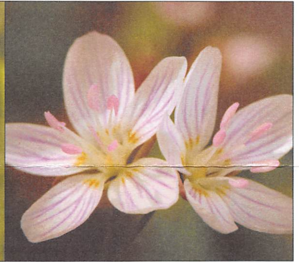
Spring Beauty