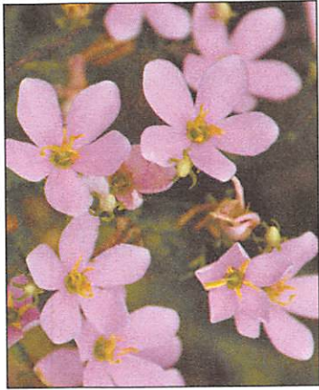
Rose Pink