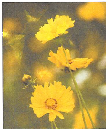
Tickseed Coreopsis