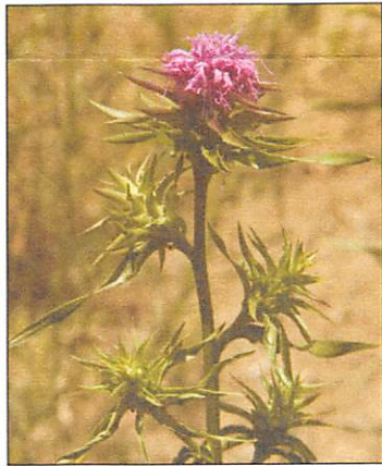
Scaly Blazing Star