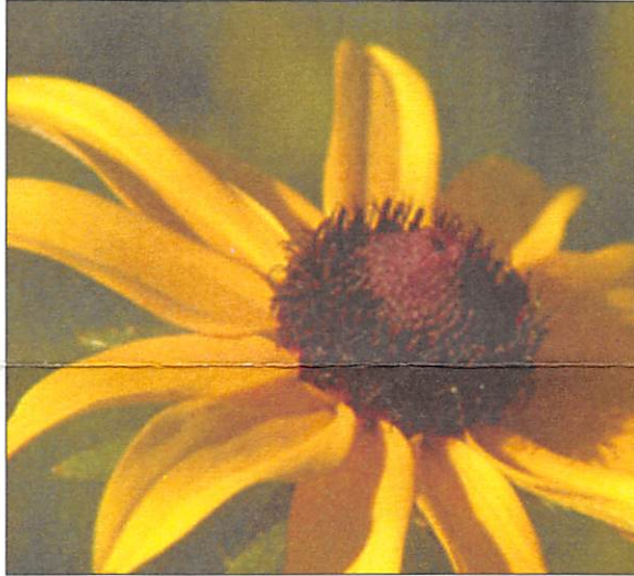
Black-Eyed Susan