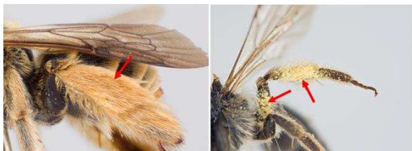
Figure 2. Detailed images taken from a user-friendly key to identify the bee families of the world (Packer and Ratti, 2009). Distinguishing characters (here: scopa on female hind legs) are described and highlighted. Further images show different forms of the character making correct identification much easier.

However, enormous knowledge gaps still exist in our taxonomic system, and taxonomic expertise is in decline. Through the Convention on Biological Diversity (CBD), governments have acknowledged the existence of a “taxonomic impediment” in 1998 on the fourth Conference of the Parties and launched the Global Taxonomic Initiative (COP 4 Decision IV/1). Thereby it is hoped to help alleviate the problem of shortage of taxonomic workforce which hinders sound work and management on biodiversity. Identification guides that can be easily used by non-taxonomists are still rare, and available for relatively few taxonomic groups and geographic areas (e.g. Eardley et al. 2010). For bees, there exist fully-illustrated keys to family level (Packer & Ratti 2009, Fig. 2) and the monograph of Michener (2007) with keys to genera and subgenera, but for many important groups of pollinators like Diptera (see Ssymank et al. 2008), there remains a need for keys and catalogues. DNA barcoding has shown promise for the identification of bees and other pollinators (Packer et al. 2009). However, additional genetic markers may be required to obtain clearer patterns of species differentiation.