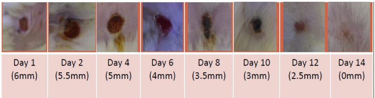
Figure 5: Wound healing measurement on aqueous extract.