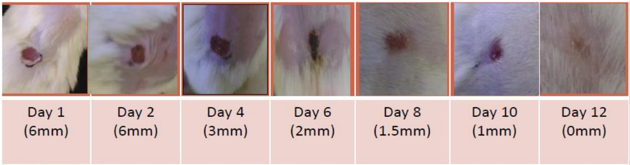
Figure 3: Wound healing measurement on methanolic extract.