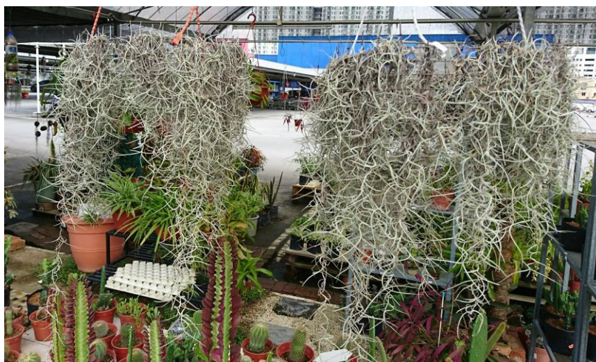
Figure 1: Spanish moss ( Tillandsia usneoides ).