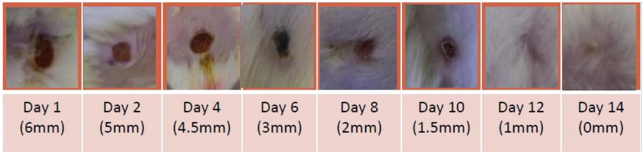
Figure 4: Wound healing measurement on ethanolic extract.