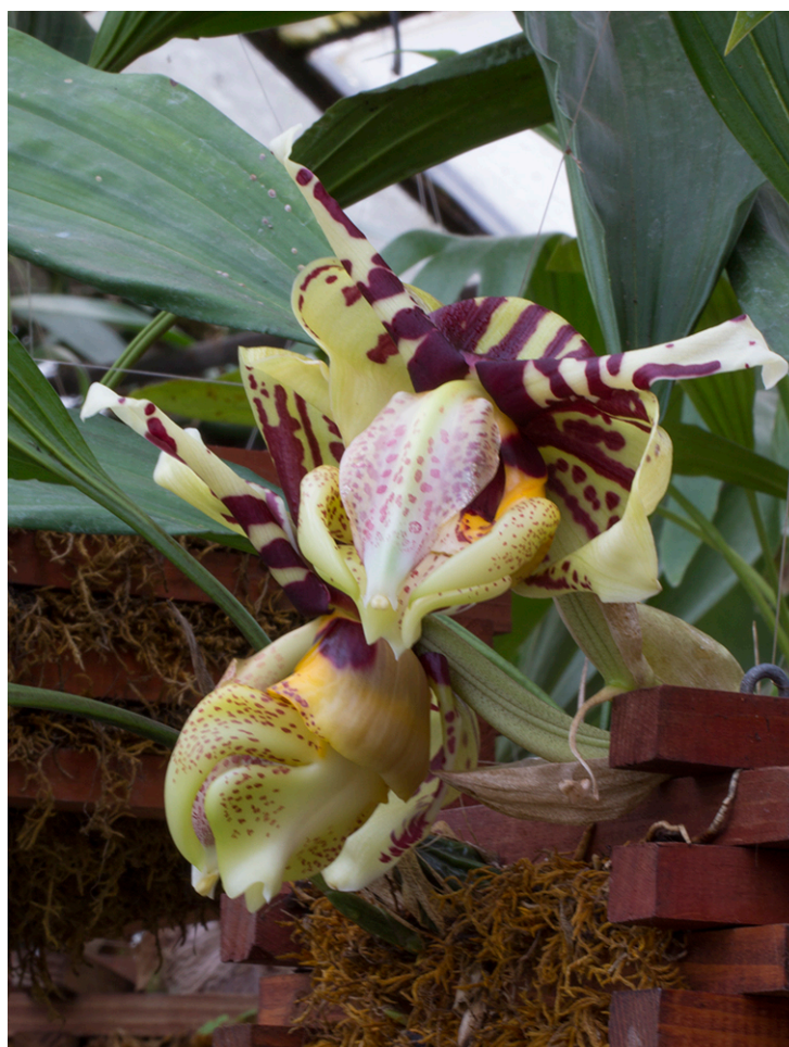
Stanhopea hernandezii , flowered in January 2014