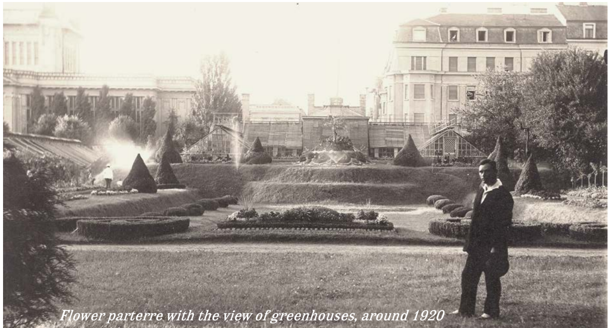
Flower parterre with the view of greenhouses, around 1920

125 th Anniversary Celebration (1889 – 2014)