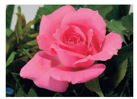
'Pink Moon' is a sport of the ever-popular 'Blue Moon' with a good perfume.

Knight's Roses has a long list of new-release roses for 2016 which range from a rose to commemorate the fallen soldiers of World War 1 to a rose with an award-winning scent. 'We Will Remember Them' is a Hybrid Tea Rose with large, high-centred blooms that are rich yellow edged with bright orange. Growing to 1.7 \,\mathrm{m}\,\mathrm{x}\,1.2 \,\mathrm{m} , this variety repeat flowers in flushes throughout the growing season. It has long, straight stems and a fresh, sweet rose fragrance. The bush is upright, vigorous and hardy with good disease resistance.