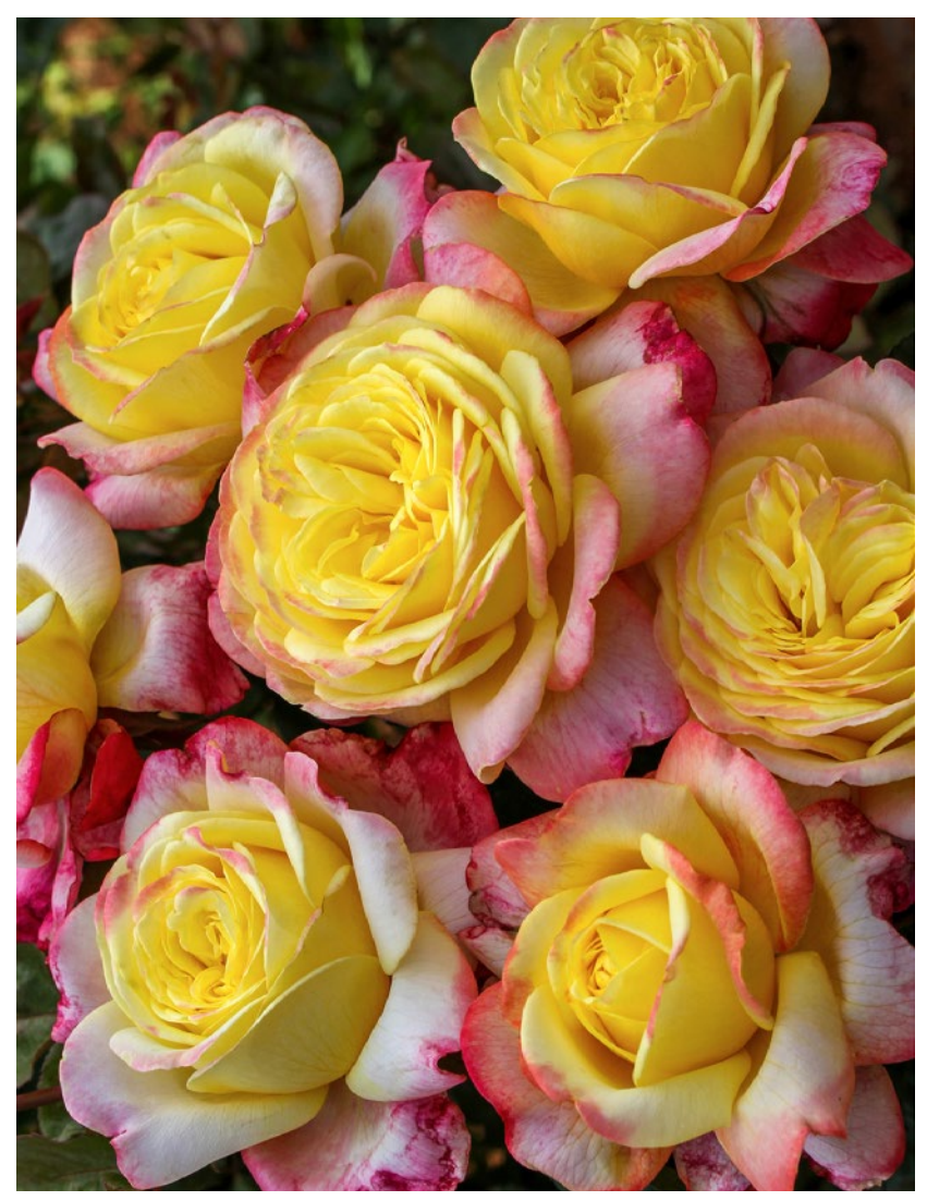
'Kordes Jubilee' is celebrating 125 years of rose breeding by the German company.

With an accent on fragrance, Treloar is releasing 'Dark Desire', a Hybrid Tea Rose from Kordes' Parfuma collection. The red rose has a fragrance described as lemon and rose geranium. It has vigorous growth, is disease tolerant and grows to around 1m high and 60cm wide. Also part of the Parfuma collection is 'First Crush' a pastel-pink Floribunda Rose with a fruity fragrance and healthy foliage. It grows to around 1m tall and 80cm wide.