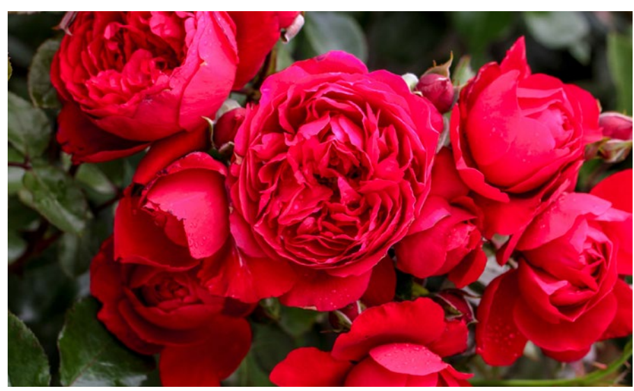
'Florentina' is a new compact climbing rose that's ideal for a small, sunny spot.

limbing Max is a new group of climbing roses to look out for and is especially well suited to gardeners with a small but sunny vertical space. 'Florentina' is robust with gorgeous double red blooms of a nostalgic appearance. It grows approximately 2m high x 1m wide and will bloom repeatedly throughout the flowering months, putting on a spectacular display against a background of lush, disease-free foliage. Climbing Max roses are bred by Kordes and available from Treloar Roses.