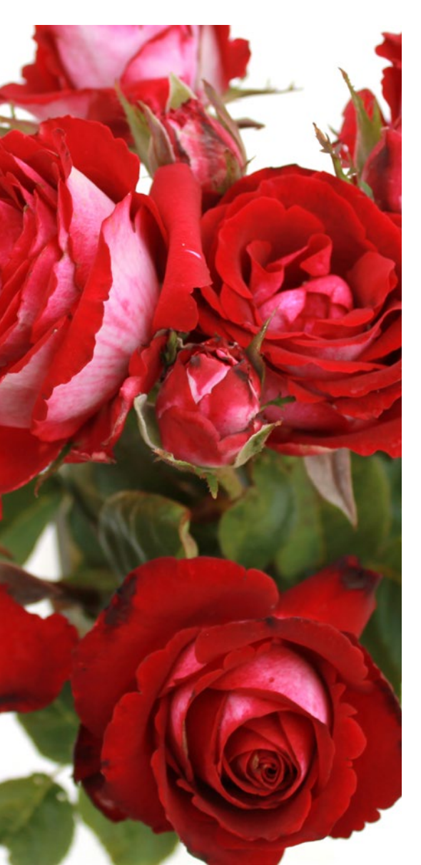
'A Daughter's Gift' is a charity rose with striking flowers.