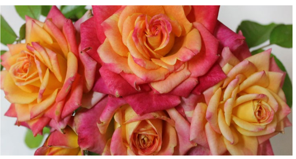
Sales of 'City of Perth' raise funds for the homeless in Perth.