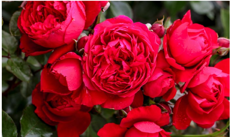
'Florentina' is a new compact climbing rose that's ideal for a small, sunny spot.

C limbing Max is a new group of climbing roses to look out for and is especially well suited to gardeners with a small but sunny vertical space. 'Florentina' is robust with gorgeous double red blooms of a nostalgic appearance. It grows approximately 2m high x 1m wide and will bloom repeatedly throughout the flowering months, putting on a spectacular display against a background of lush, disease-free foliage. Climbing Max roses are bred by Kordes and available from Treloar Roses.