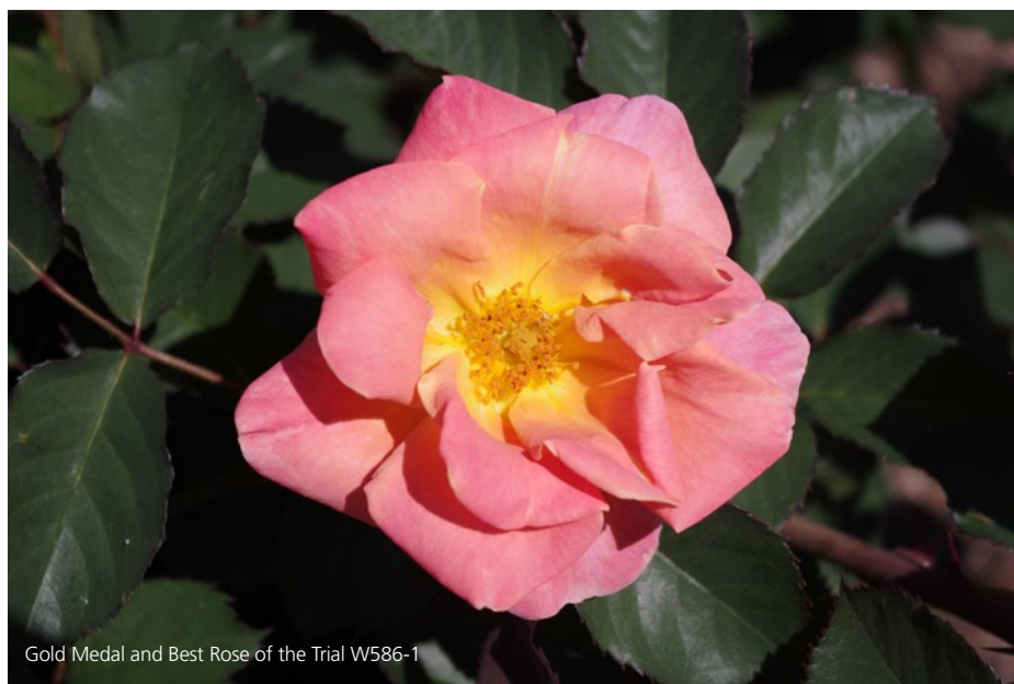
Gold Medal and Best Rose of the Trial W586-1

The assessment criteria used involves judging the 'General Impression' (30 per cent of score), 'Flowering and Flower Quality' (30 per cent of score), 'Pest and Disease Resistance' (30 per cent of score) and 'Fragrance' (10 per cent of score).