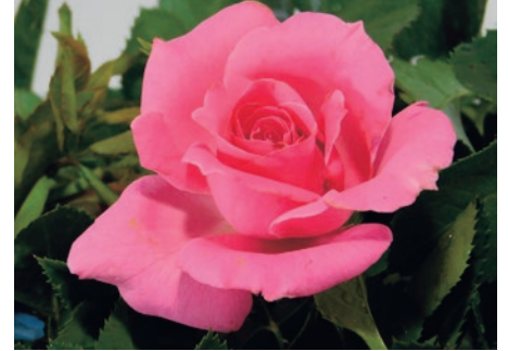
'Pink Moon' is a sport of the ever-popular 'Blue Moon' with a good perfume.

'Per-Fyoom Perfume' didn't get an award for its