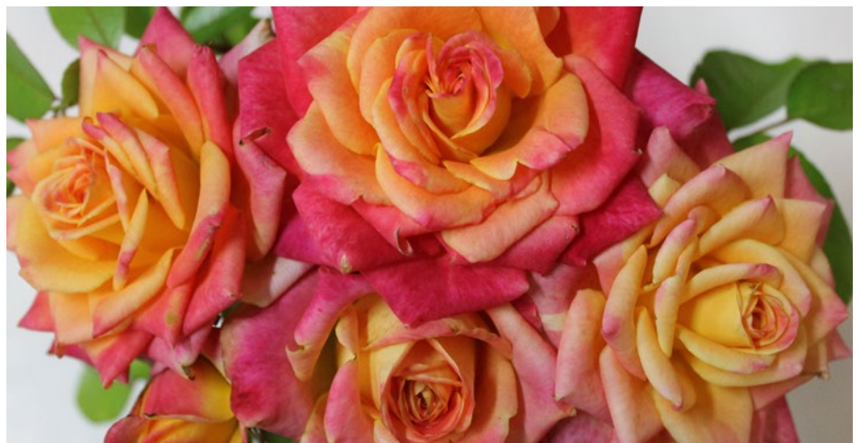
Sales of 'City of Perth' raise funds for the homeless in Perth.