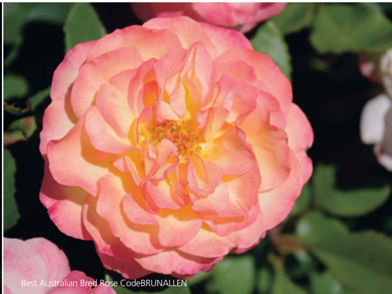
Best Australian Bred Rose Code BRUNALLEN

persica (syn. Rosa persica ) resulting in the eye at the base of each flower, reminiscent of oriental poppies and tree peonies.