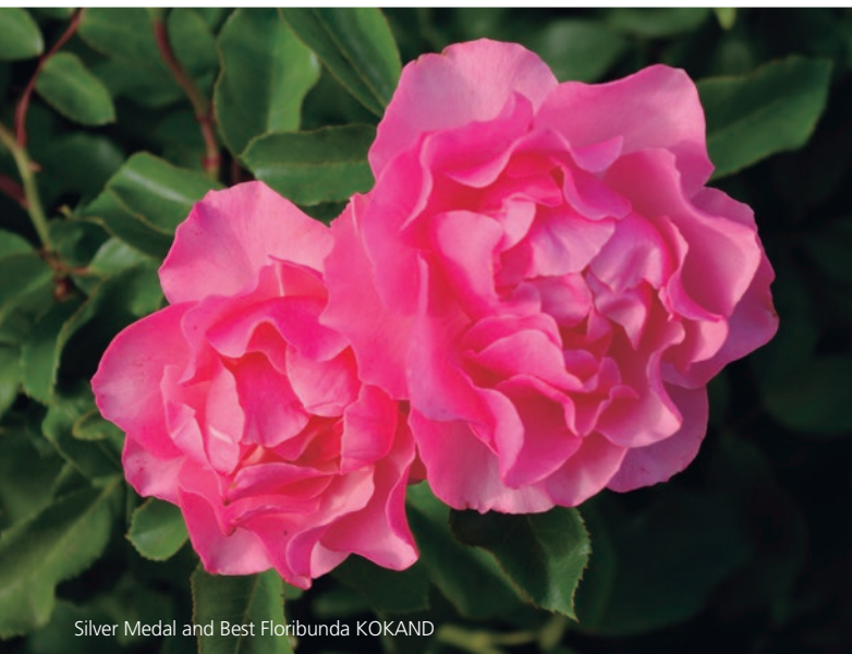
Silver Medal and Best Floribunda KOKAND