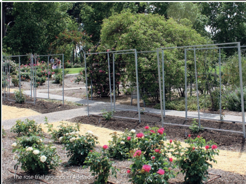
The rose trial grounds in Adelaide