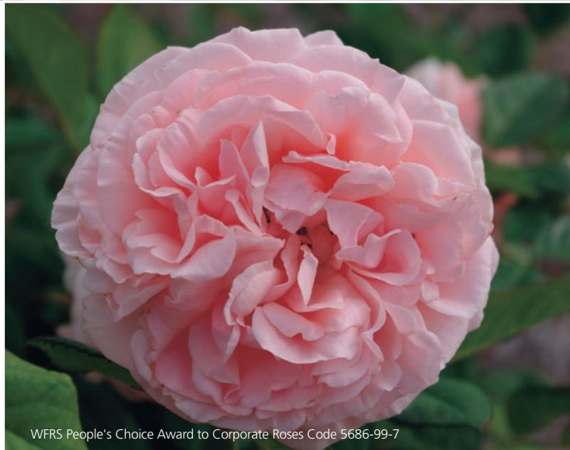
WFRS People's Choice Award to Corporate Roses Code 5686-99-7

Visit the website www.nationalrosesrialgarden.net.au for more information.