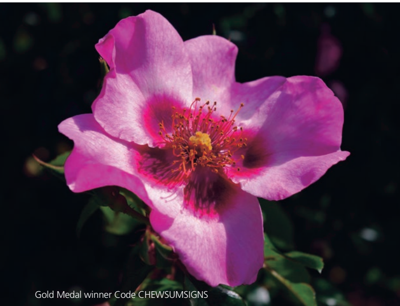
Gold Medal winner Code CHEWSUMSIGNS