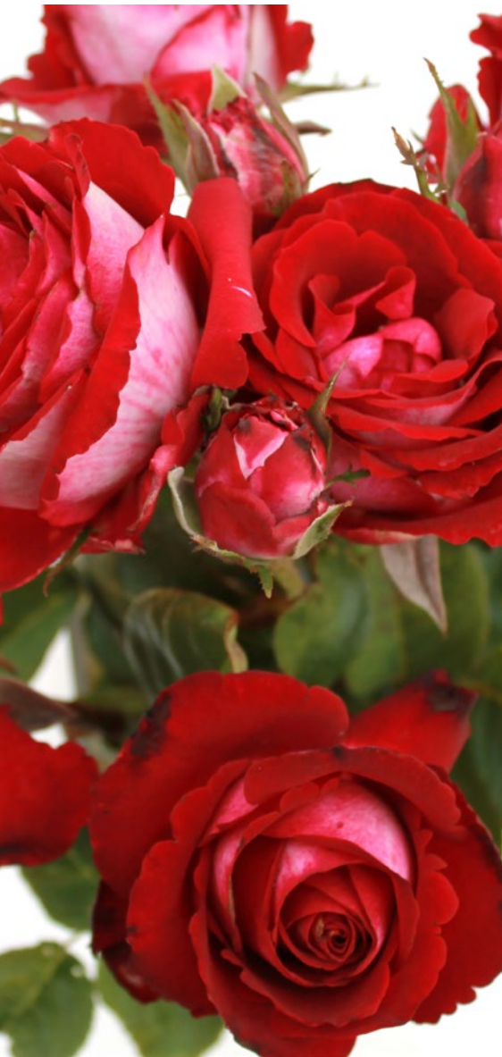
'A Daughter's Gift' is a charity rose with striking flowers.