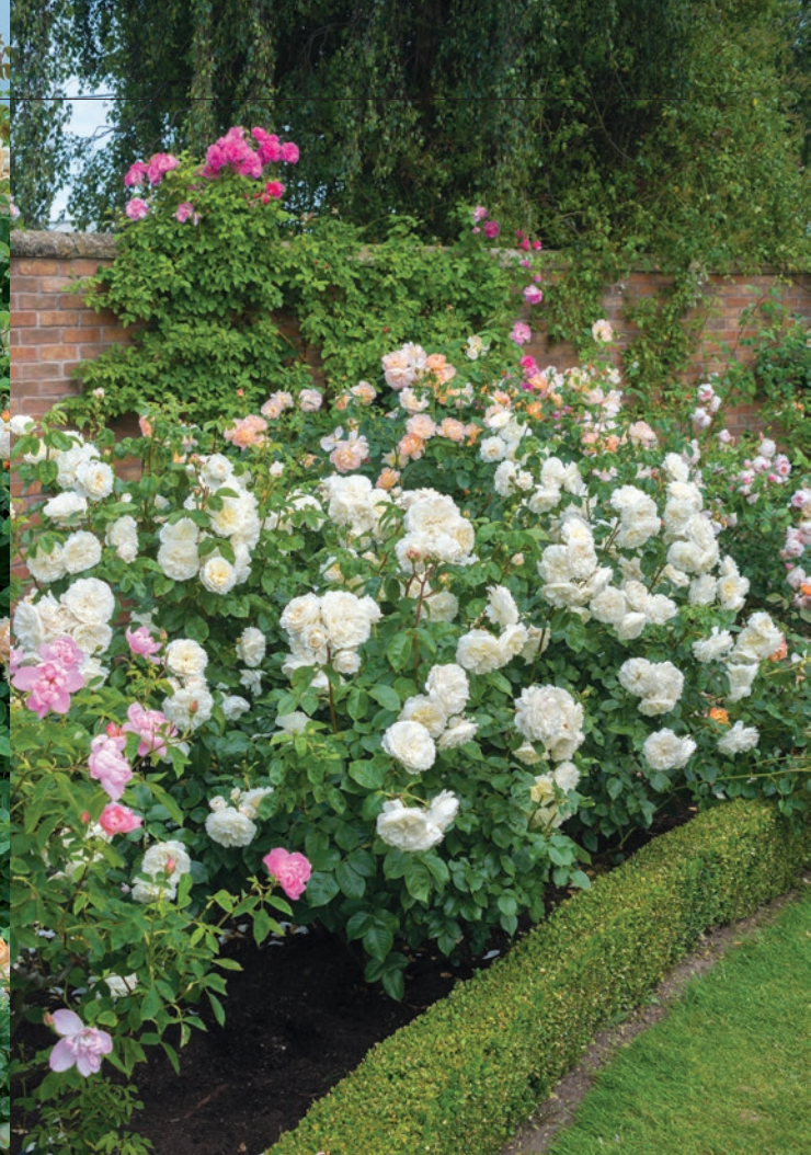
'Wollerton Old Hall' (left) and 'Tranquillity' are new in Australia from David Austin in the UK.