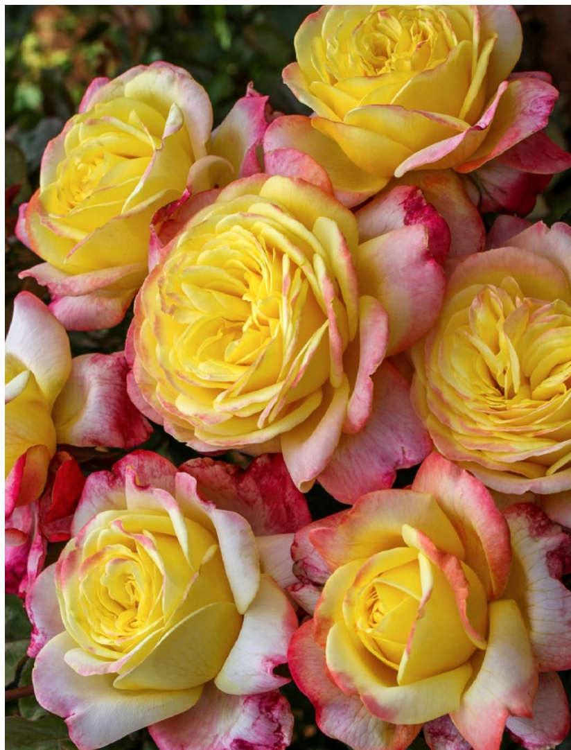
'Kordes Jubilee' is celebrating 125 years of rose breeding by the German company.

With an accent on fragrance, Treloar is releasing 'Dark Desire', a Hybrid Tea Rose from Kordes' Parfuma collection. The red rose has a fragrance described as lemon and rose geranium. It has vigorous growth, is disease tolerant and grows to around 1m high and 60cm wide. Also part of the Parfuma collection is 'First Crush' a pastel-pink Floribunda Rose with a fruity fragrance and healthy foliage. It grows to around 1m tall and 80cm wide.