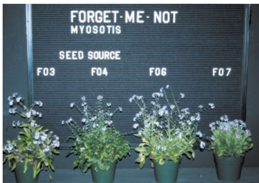
Left to right: Forget-me-not 'Alaska State flower', Denali Seed Co., Anchorage, Ala.; Forget-me-not 'Bobo series Blue', 'Indigo Blue' and 'Bluesylva', Germania Seed Co., Chicago, Ill.