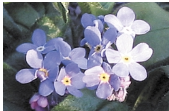
Forget-me-not 'Bluesylva'.

Looking like scorpions with mouse ears, forget-me-nots have been successful as flowering potted plants in local markets, and their scarcity could mean higher profit margins for growers.