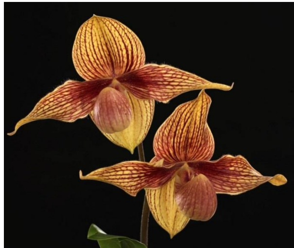
Paphiopedilum Alexej AM/AOS

Most of the F-1 crosses of Paph hangianum are primaries with other Paph species. There have been 66 registered since 2004. The tessellation at the base of the petals and dorsal seem to breed true. The species has 88 progeny in 3 generations. None of the progeny are particularly good at producing offspring. Shun-Fa-Golden has 12 offspring, Wossner 6, Liberty Taiwan 4 and the only second generation grex with a single offspring is Emerald Gate. So, overall this species is not a significant player in Paph hybridization.