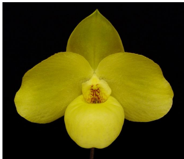
Paphiopedilum Wossner China Moon AM/AOS