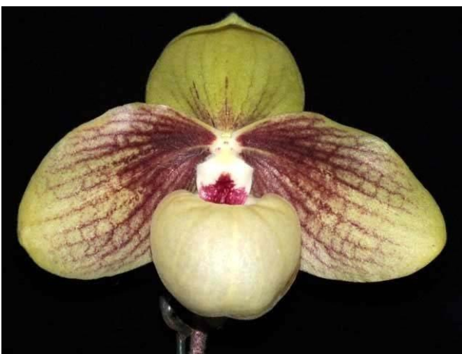
Paphiopedilum Shun-Fa Golden AM/AOS