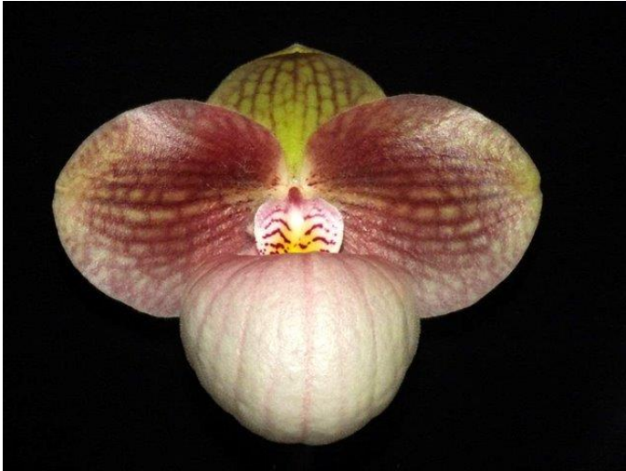
Paphiopedilum Liberty Taiwan AM/AOS