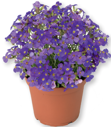
Aubrieta Audrey Light Blue