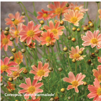
Coreopsis 'Sweet Marmalade'

Colocasia esculenta Royal Hawaiian Black Coral from PlantHaven has elegant glossy dark black foliage with electric blue veins held on dark petioles. It has a tidy, clump forming habit with short runners developing close to the mother plant. Plants reach 48 inches tall by 36 inches wide at maturity. Hardy in Zones 7b-11. Use in large containers, garden borders and landscape plantings.