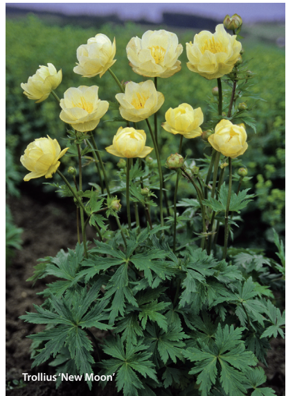
Trollius 'New Moon'

'Seabrooks Lavender' from Blooms of Bressingham is a very floriferous and long flowering tender perennial. Covered with clusters of lavender flowers with a darker pink eye all summer until frost. It is easy to care for and can withstand drought conditions. This vigorous low growing plant reaches 3 inches high and spreads 22 inches. Hardy in Zones 8-10.