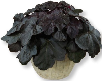
Heuchera Kira Black Forest

dramatic orange-red young leaves. As the leaves mature, they turn greener that really stands out through the silvery-gray overlay. Rain Forest features purple-red young leaves. As the leaves mature their veins turn green that really stand out through the silvery-gray overlay.