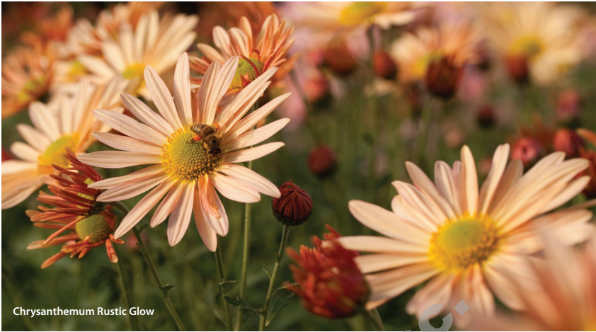
Chrysanthemum Rustic Glow

semi-double flowers with a gold edge on the ray florets. It grows to 22-24 inches tall and has 30-32 flower stems per plant with 16-18 flowers per stem. Pink Dawn has 4-inch light pink flowers with a light yellow ring of color in the ray florets beyond the disc. It grows to 22-24 inches tall and has 24-26 flowering stems per plant and 14-16 flowers per flower stem. Purple Mist produces 3½-inch single light purple flowers. Plants reach 22-24 inches tall