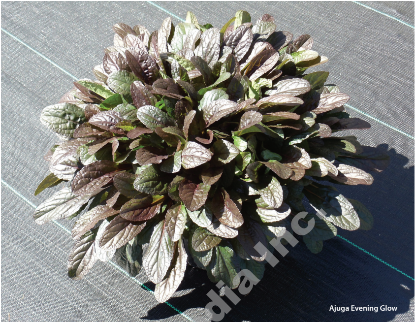
Ajuga Evening Glow

plants mature, the bud imprints become apparent and the markings become more prominent. Produced from tissue culture for consistency and quality, 'Impressive' prefers full sun and excels in landscapes.