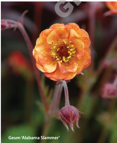
Geum 'Alabama Slammer'

produces 7½- to 8½-inch, glimmering tangerine-orange, gold-dusted flowers with a green throat. Officially classified as "unusual form", the flower tepals are narrow, twisted, and recurved with loosely ruffled edges. It flowers in late midsummer on tall, graceful, willowy scapes above the attractive arching foliage. Hardy in Zones 3-9, plants reach 34 inches tall.