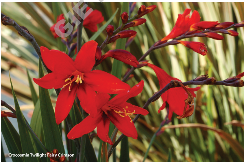
Crocosmia Twilight Fairy Crimson

Bred in New Zealand, plants produce striking multi-color blooms with a strong fragrance. They have attractive silver-blue foliage and bloom from early spring until summer. Most notable is the striking multi-color blooms.