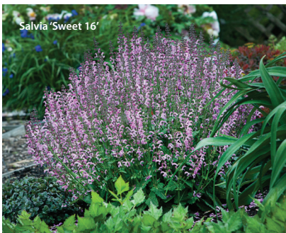
Salvia 'Sweet 16'

'Sweet 16' from Walters Gardens is a notable improvement over 'Eveline' due to its larger flowers, brighter color and branched flower stems. From late spring through early summer, 'Sweet 16' produces long stems of vibrant rose-purple buds which open to larger, brighter lavender-pink flowers with a purple lip. Secondary branching on the flower stems extends the bloom time.