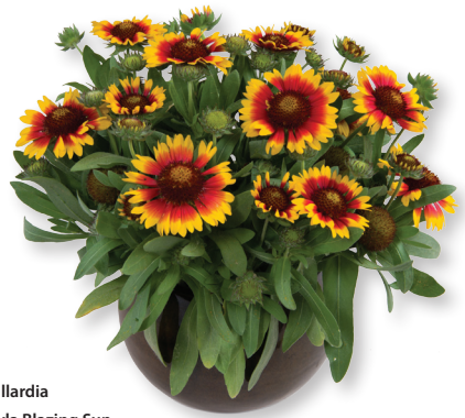
Gaillardia Gayla Blazing Sun

The Galya series from Danziger has several new varieties. G. x grandiflora additions include: Wild Fire has large-sized red with yellow rim flowers and a compact mounded habit. It flowers continuously and is hardy to Zone 5. Continuously flowering Blazing Sun has large deep red and intensive yellow flowers and a mounded compact habit. It's hardy to Zone 5. Red Head flowers continuously with unique glaring orange-yellow flowers with dark red centers. Hardy to Zone 5. Corneto