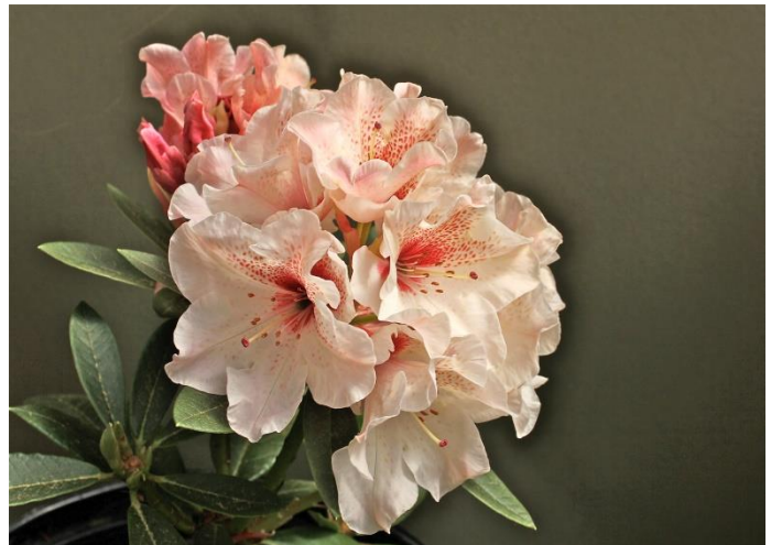
Garden Song (Rocky Point x Tia)