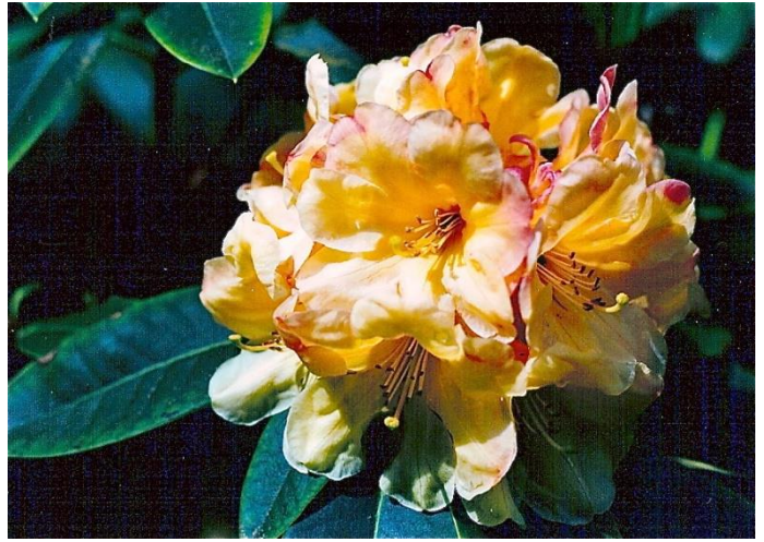
Gold Leaf ( Nancy Evans x Whopper x Brandt's Tropicana x Whitney's Pumpkin)