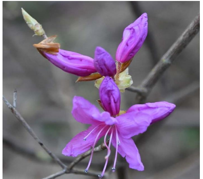
R. dilatatum