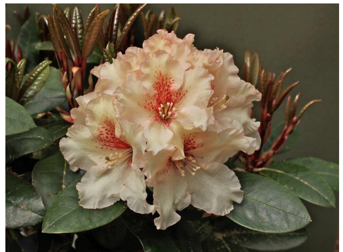
Glenna (Hotei x 1000 Butterflies)