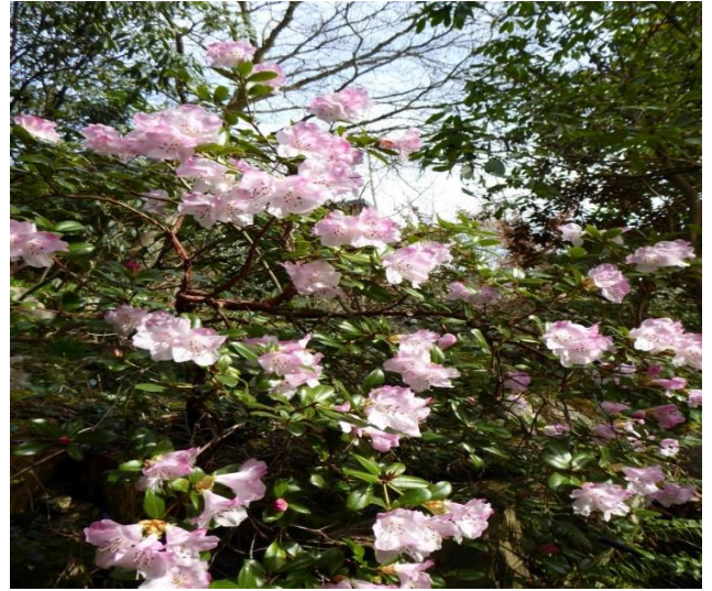
R. clipinense