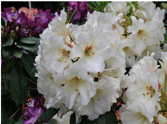
Frostlight (Janet Blair x Recital)