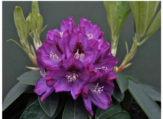
Hollis Hope (Plum High x Jonathan Shaw x Plum Passion)