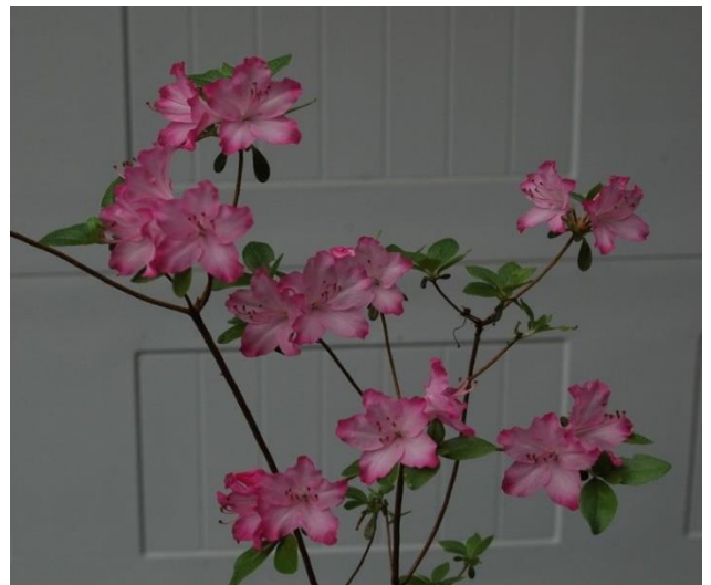
R.kiusianum "Komo Kulshan"