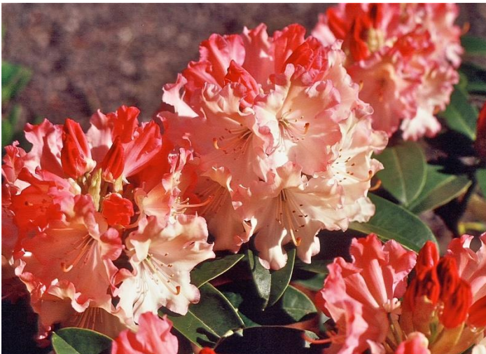
Heidi's Love (Nadia x Pink petticoats x r.yakushimanum)