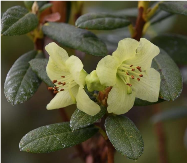
R. brachyanthum ssp hypolepidotum Harold Fearing