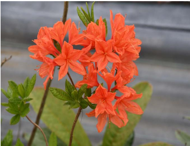
R. molle ssp japonicum Harold Fearing