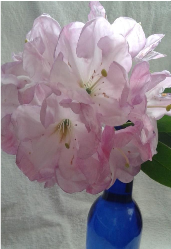
R. fortunei (pink)