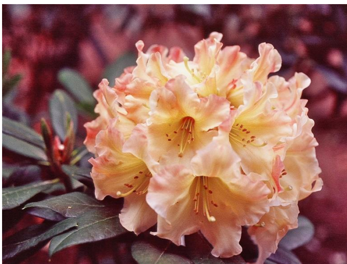
Ginger Peach (Nancy evans x r.yakushmanum x Goldfort x Odee Wright)