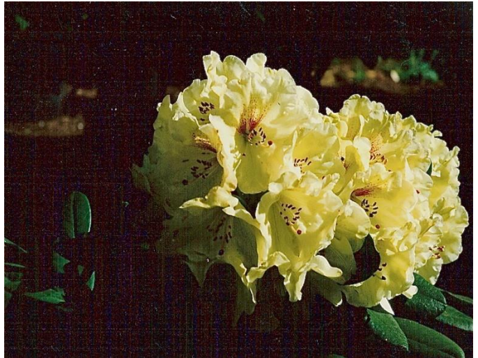
Happy Hour ( Bergs Yellow x Marie Starks)