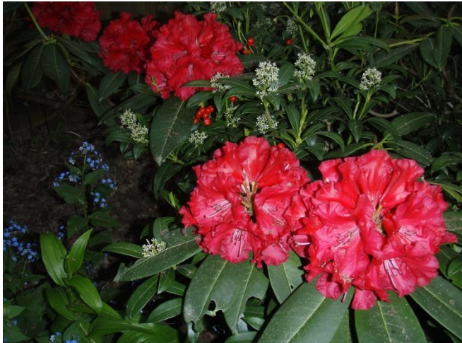
R. barbarum Hilda Nuestadter (along with brunnera & flowering skimmia))