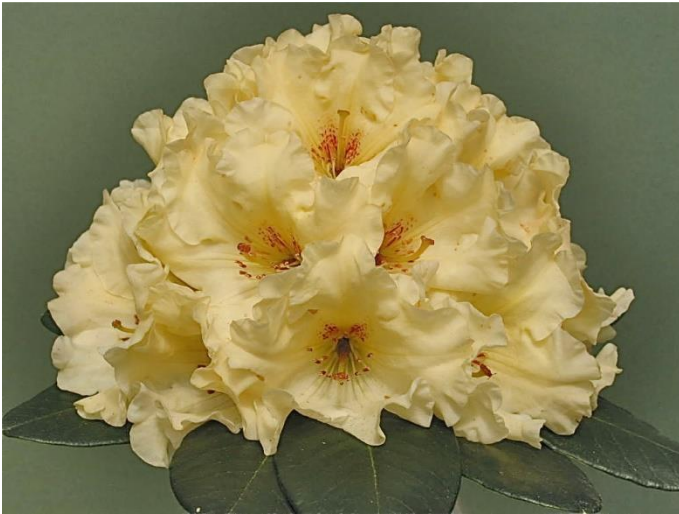
Grand Recital ( Mindy Love x Jessie's Song)