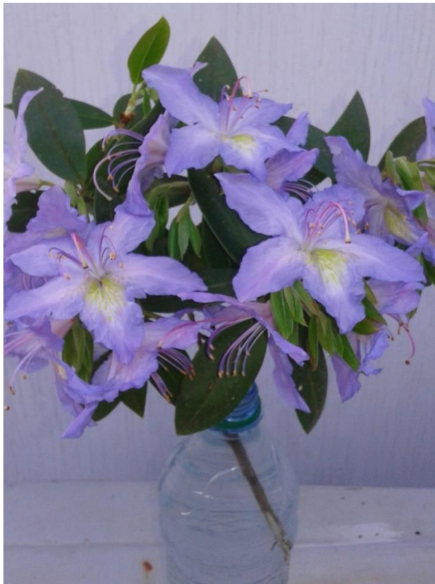
R. augustinii Playfair