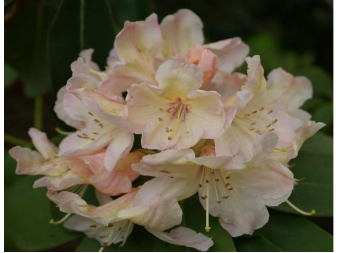
Glendoick's Ice Cream