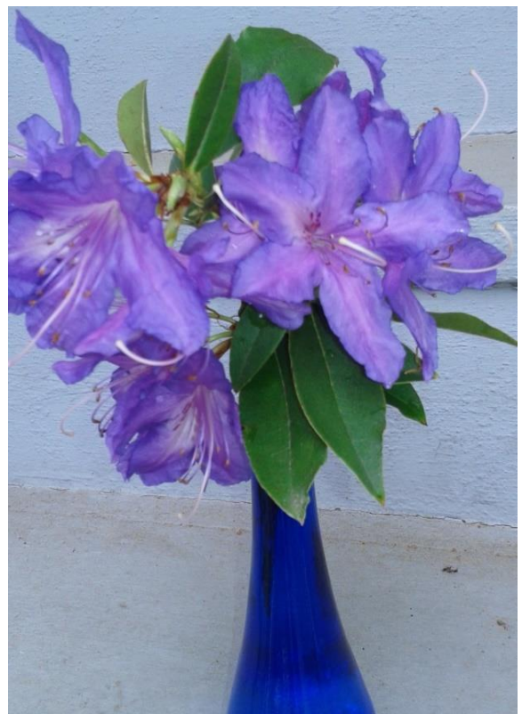
R. augustinii Marine