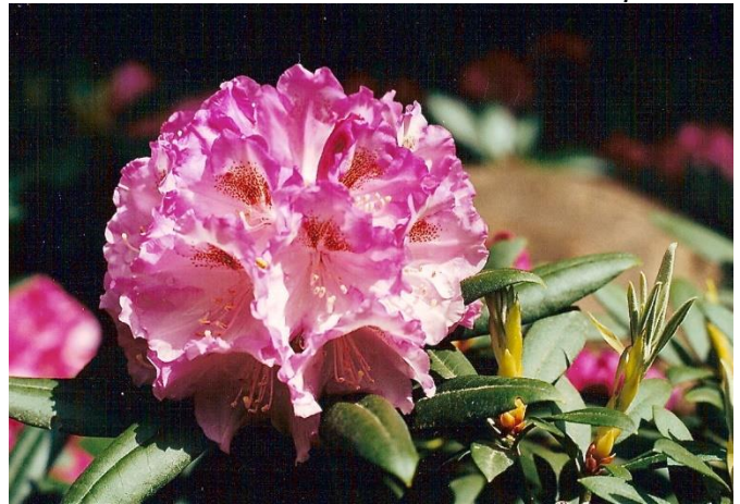
Frosted Plum (r.yakushmanum x Frank Galsworthy)