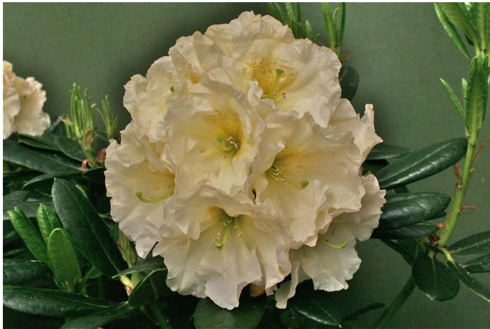
Frosted Lemon (Scintillation x Recital)