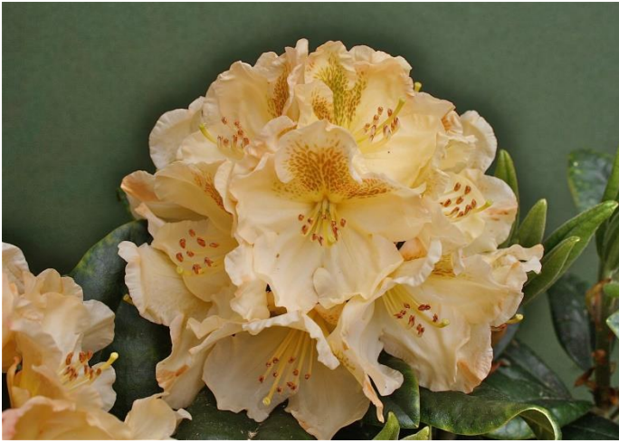
Golden Mist (Percy Wiseman x Windwalker)