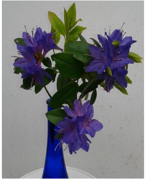
. Llam Violet