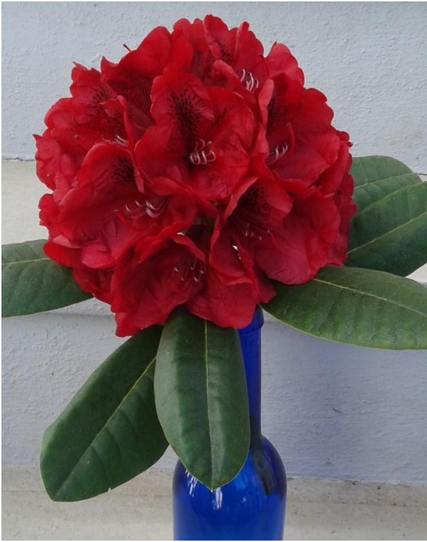
Queen of Hearts