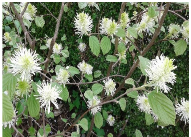
Fothergilla Gardenii Colleen Bojczuk