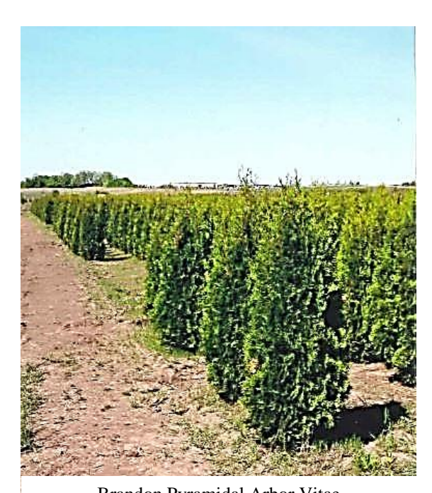
Brandon Pyramidal Arbor Vitae

Email: cni@frontier.com Website: crossnurseries.com