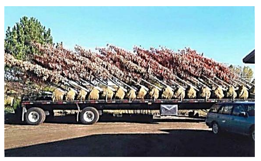
Truck load of Red Maple Trees