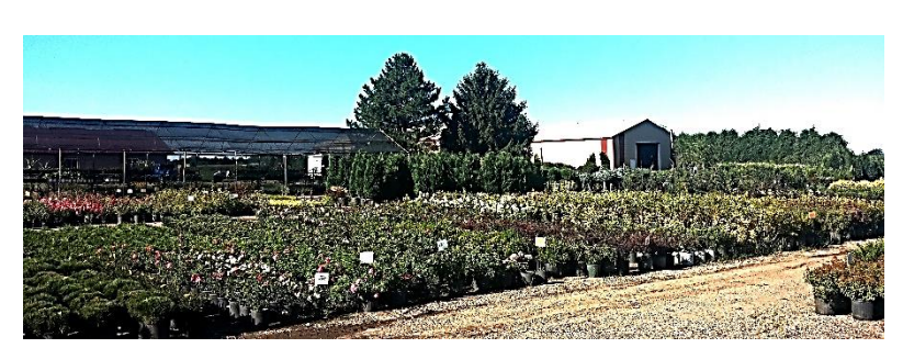
Cross Nurseries Container Yard