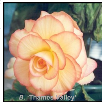
B. 'Thames Valley'