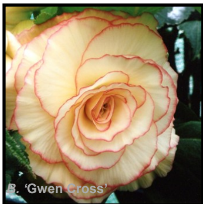
B. 'Gwen Cross'

I knew nothing about tuberous begonias and thought they were like bulbs and would multiply and I didn't know how to take cuttings, cross pollinate or that each plant had male & female flowers. I caught six bees and put them in the shadehouse - thought they would like the beautiful flowers - but they couldn't get out quick enough.