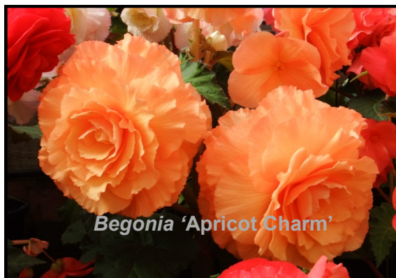
Begonia 'Apricot Charm'

My wife and I live in Burnie on the north west coast of Tasmania. About thirty years ago I bought three non-stop tuberous begonias. Later I bought seven Blackmore and Langdon named tubers. When they flowered I was hooked! They were B. 'Sam Phillips', B. 'Jim Kirby', B. 'Vin Rouge', B. 'Judy Langdon', B. 'Melissa', B. 'First Love' and B. 'Harlequin Cascade'.